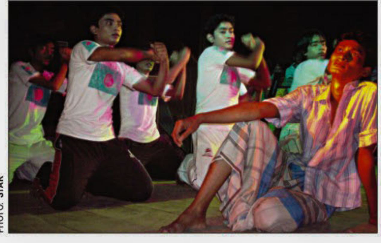
Actors stage a play at Shaheed Mansur Ali Auditorium in Sirajganj.