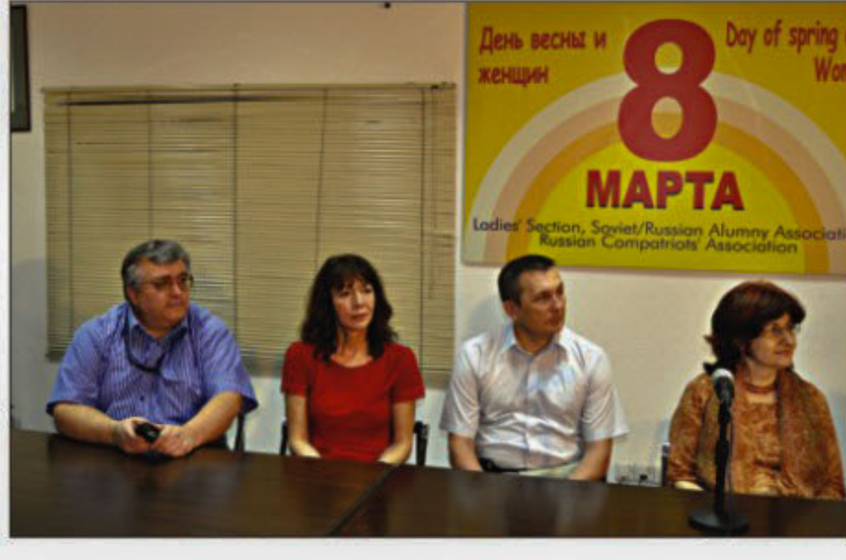
Discussants at the Russian Centre of Science & Culture in Dhaka.