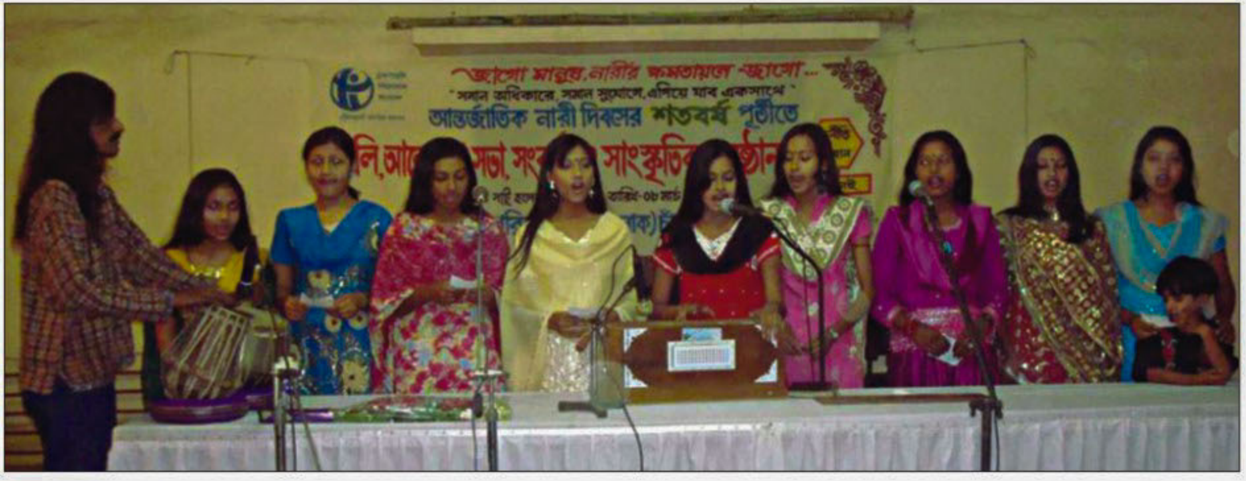
Group performance at the programme in Chapainawabganj.