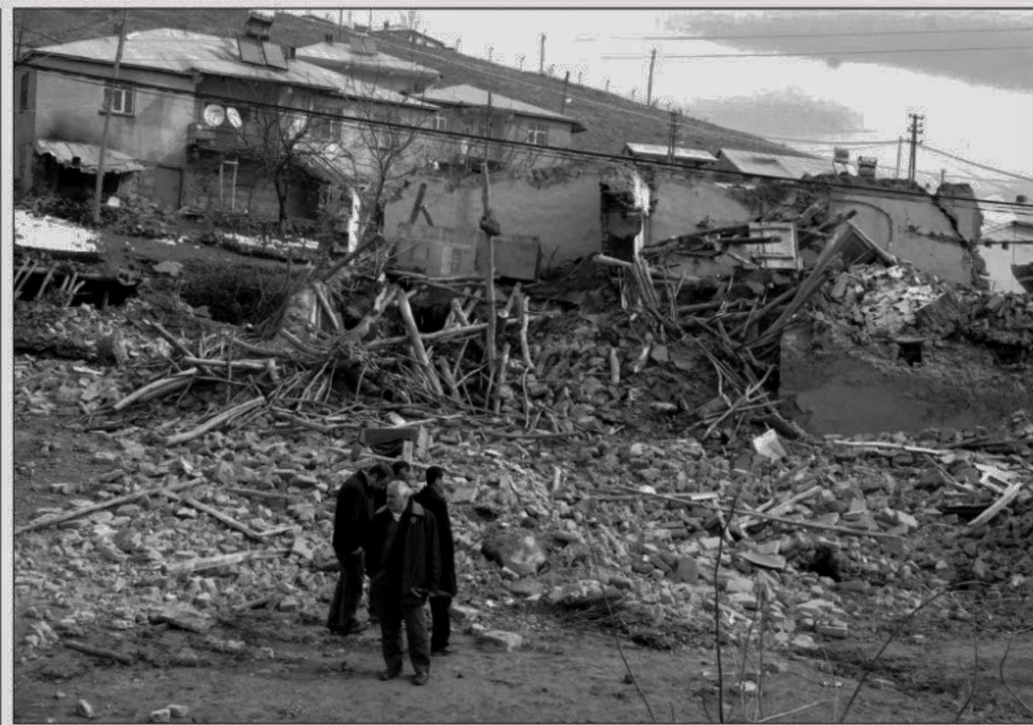
People walk around a destroyed house in Karakocan, in the Elazig province in Turkey after a devastating quake. At least 57 people were killed in the earthquake measuring 6.0 on the Richter scale.