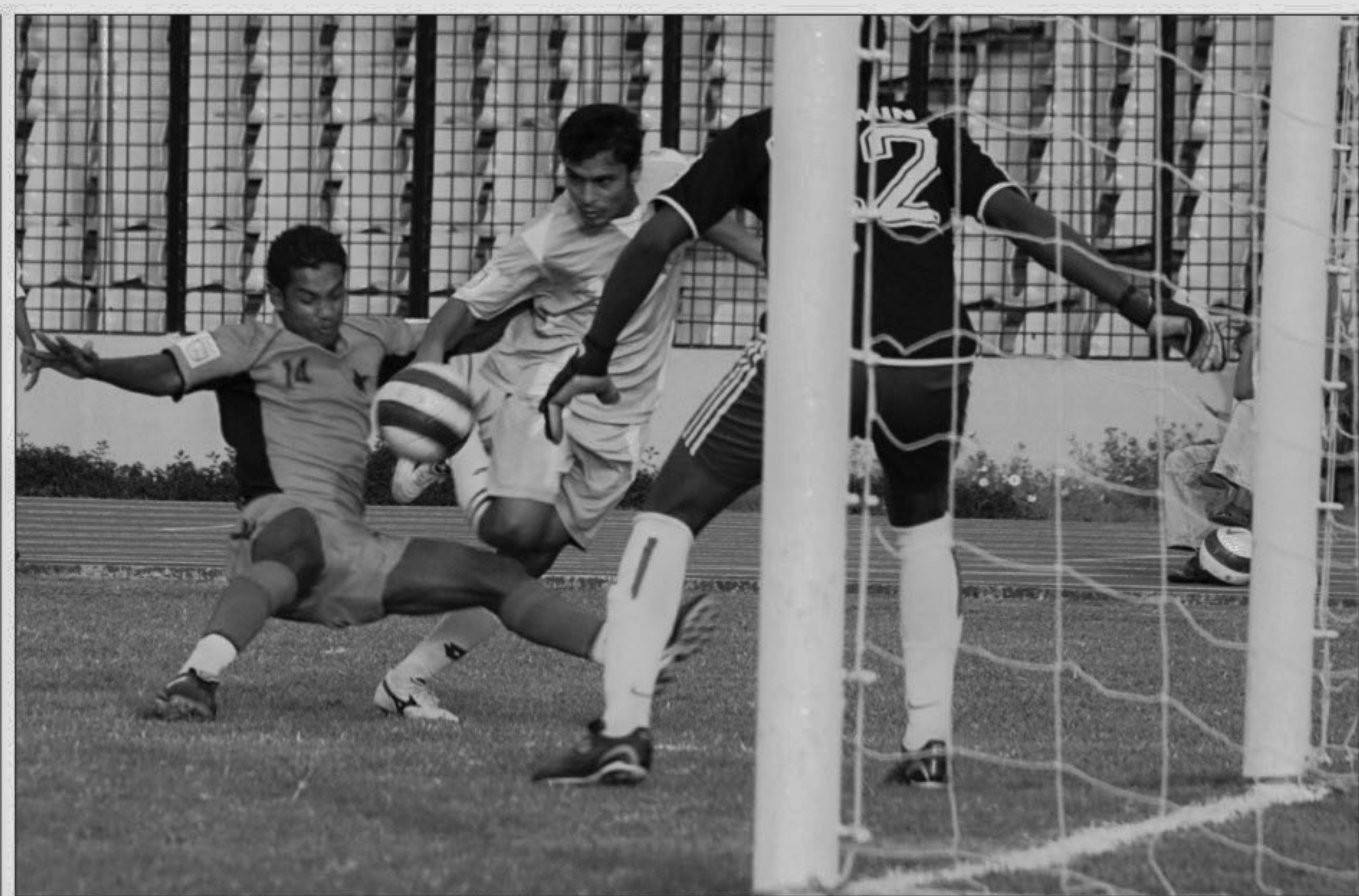
A goalmouth action from the Bangladesh League match between Farashganj Sporting Club and Shuktara Jubo Sangsad at the Bangabandhu National Stadium yesterday.