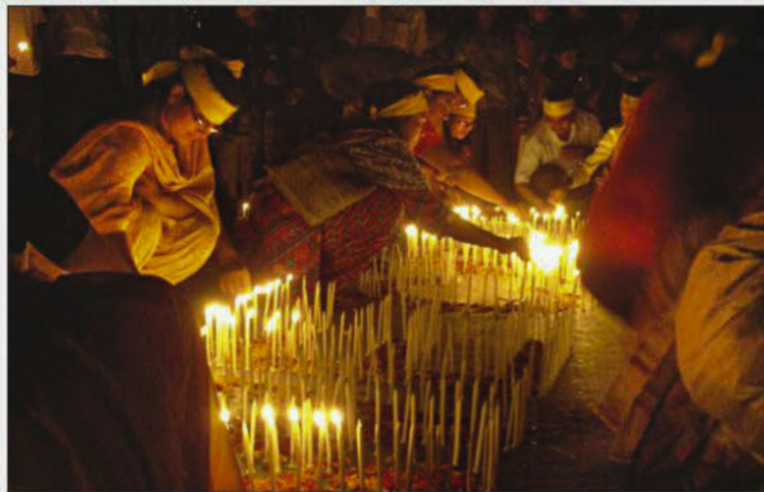
Around 1000 candles were lit at Dinajpur Institute premises.

Later, an activist group, under the theme 'we can do it', lit around 1000 candles at Dinajpur Institute premises with a promise to spread the lights to curb the attitude towards women in the society.