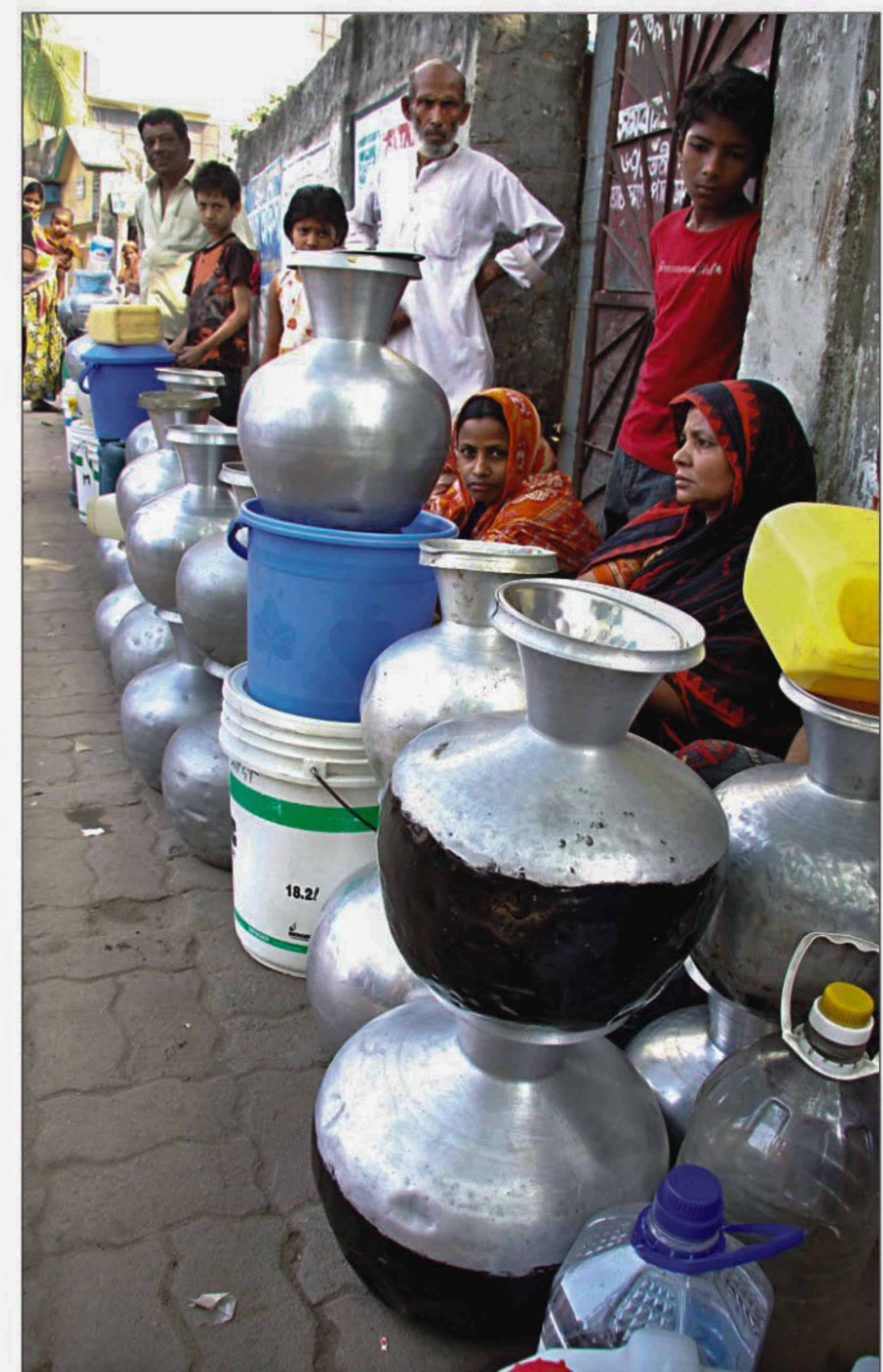
People queue up for water at a WASA pump in the city's Mugdapara area yesterday morning. Locals say they have been getting supply of smelly water for last two months.