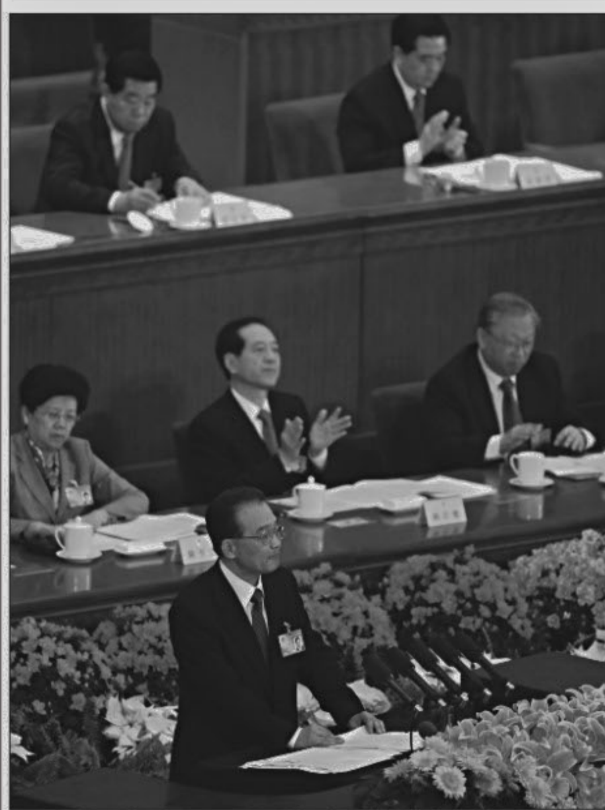
Chinese President Hu Jintao (top/R) applauds as Premier Wen Jiabao delivers his speech during the opening session of the National People's Congress inside the Great Hall of the People in Beijing yesterday.

Shortly after the Moon formed, an asteroid smacked into its southern hemisphere and gouged out a truly enormous crater, the South Pole-Aitken basin, almost 1,500 miles across and more than five miles deep.