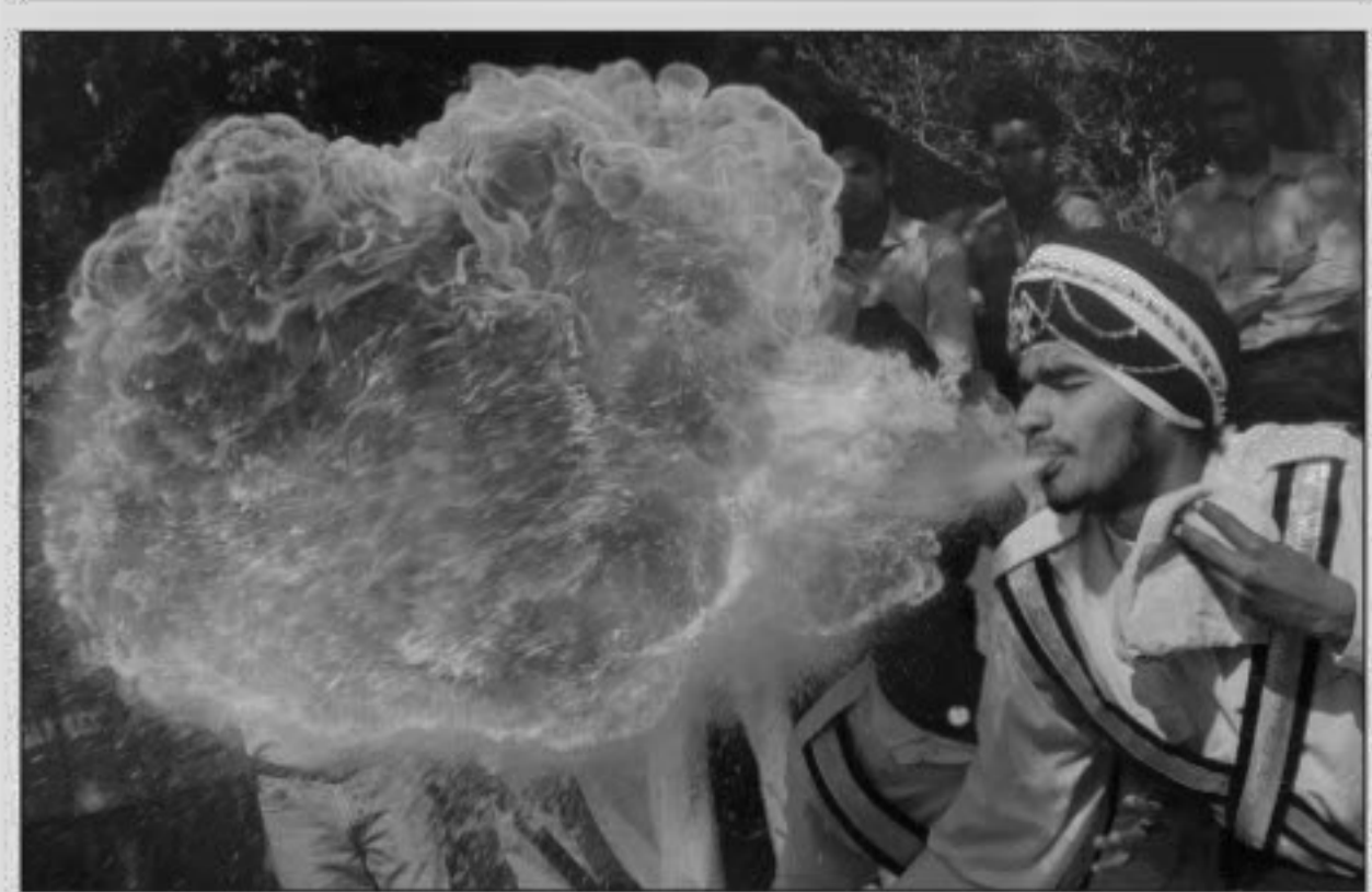
An Indian Nihang (religious Sikh warrior) performs a fire breathing act while participating in a procession during the Amritsar Heritage Festival in Amritsar yesterday. The festival, which runs from March 4-7, aims to preserve and promote Punjabi culture.

Malaysia, Singapore and Indonesia said Thursday they have stepped up maritime and air patrols in the waterway, through which 15 million barrels of oil a day passed in 2006, according to the US Energy Information Agency.