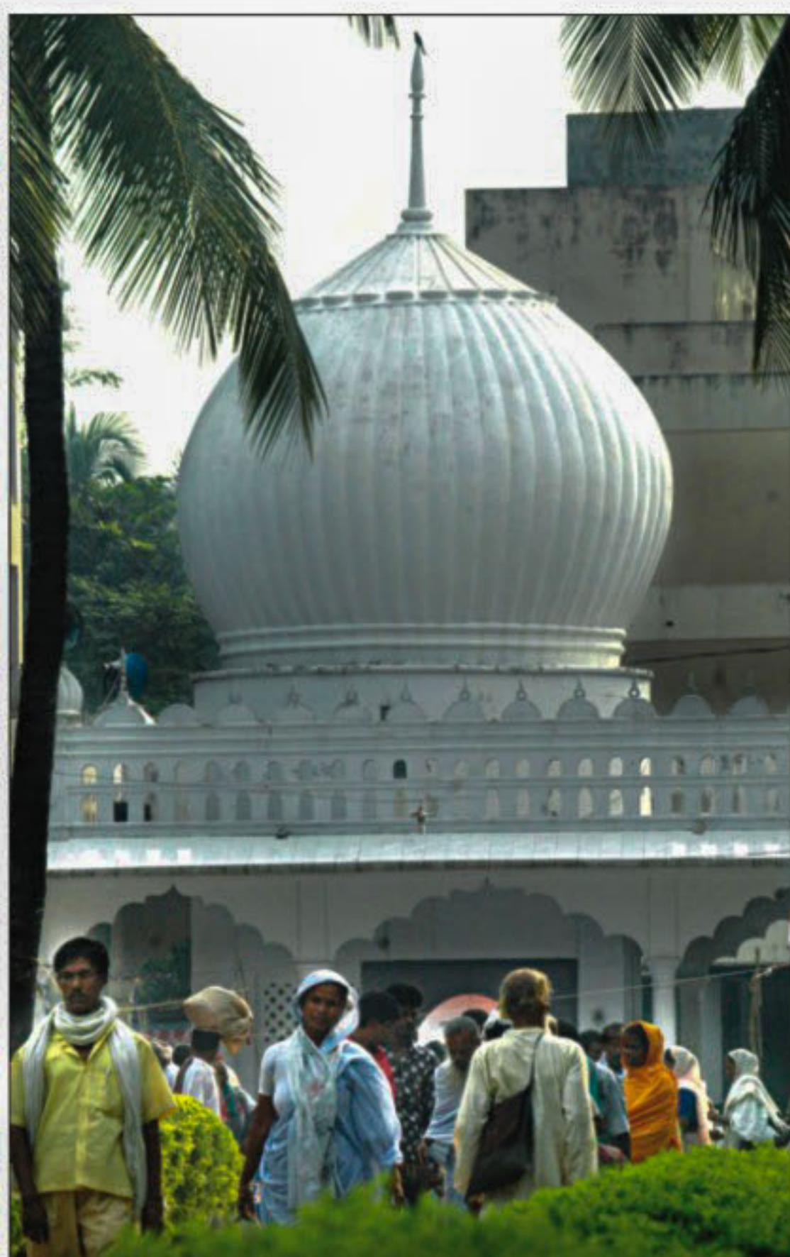
Lalon devotees through the venue.