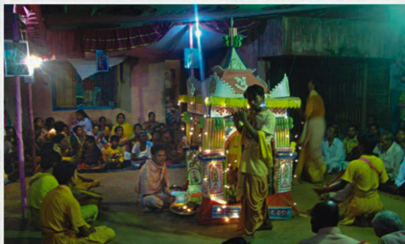
A group of musicians perform at the programme.