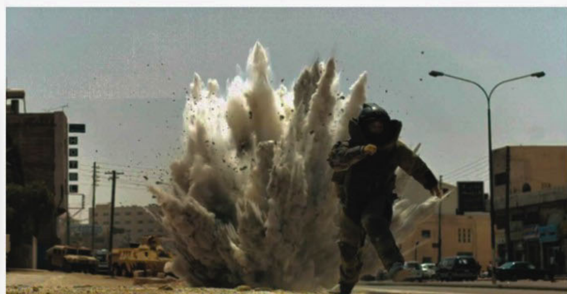
The Hurt Locker has been nominated for nine awards.