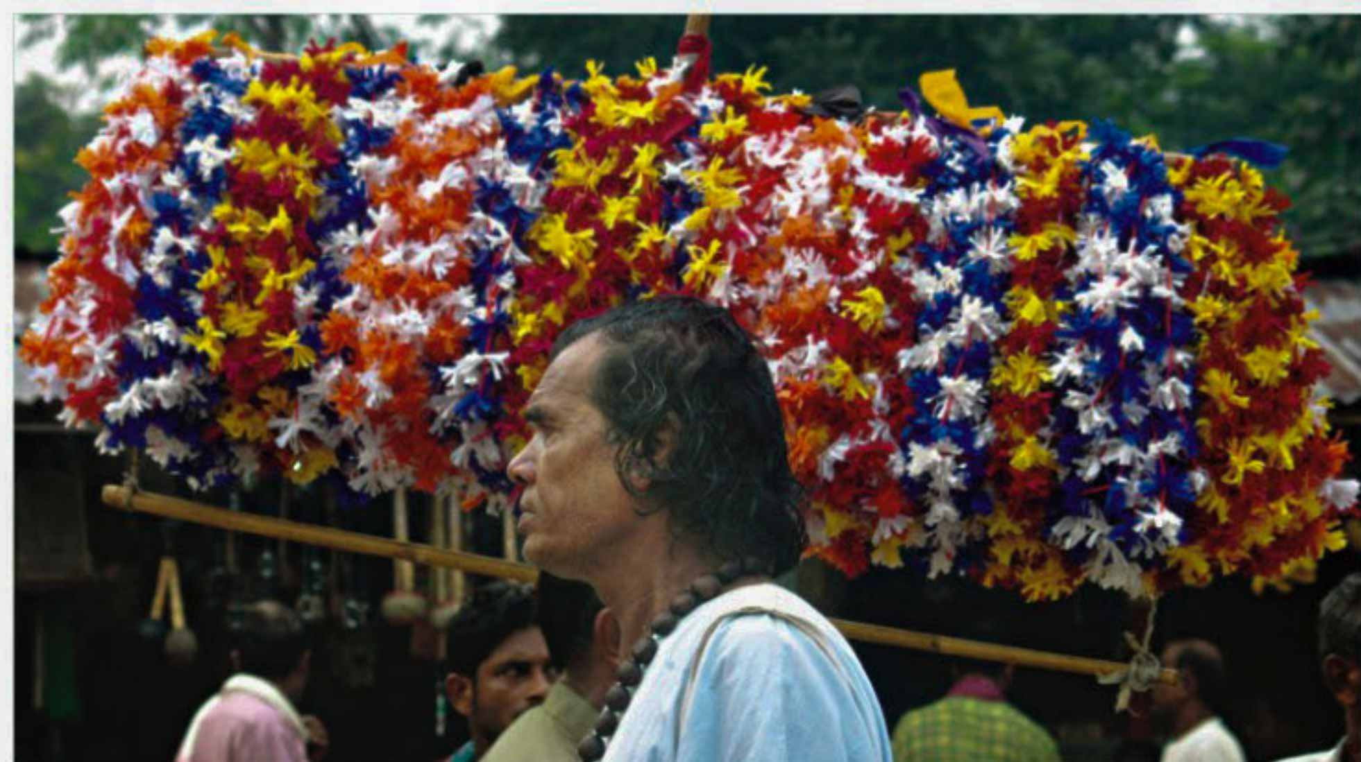
The events included renditions of Lalon songs by baul musicians from all over the country and a 'Lalon Mela' (fair).