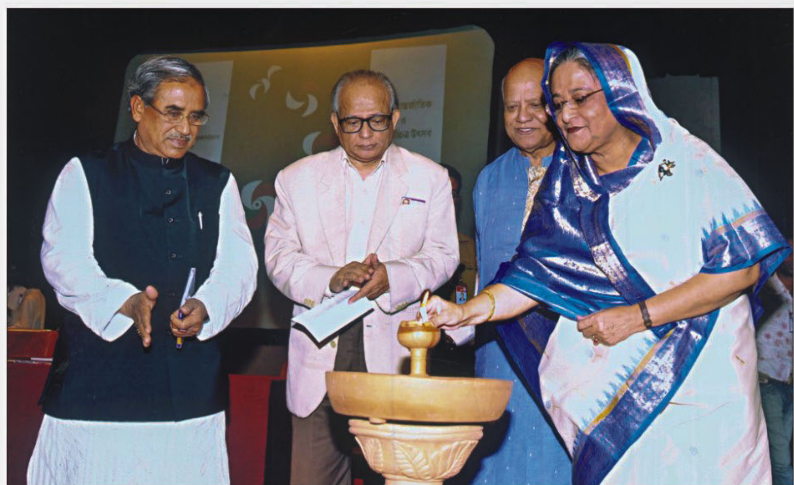
Prime Minister Sheikh Hasina inaugurates the 11th International Short Film Festival at the National Museum auditorium at Shahbagh in the city yesterday by lighting a lamp.

A total of 160 short films from 30 countries, including hosts Bangladesh, will be screened during the festival.