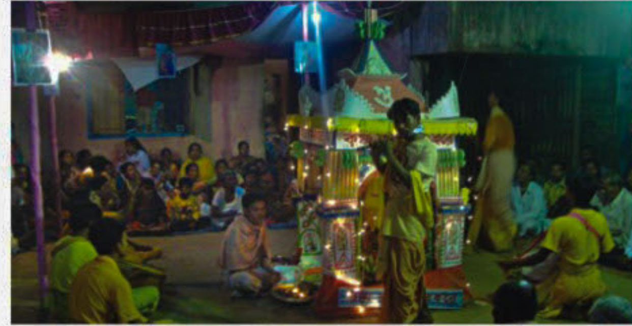
A group of musicians perform at the programme.

A 15-member committee organised the programme.