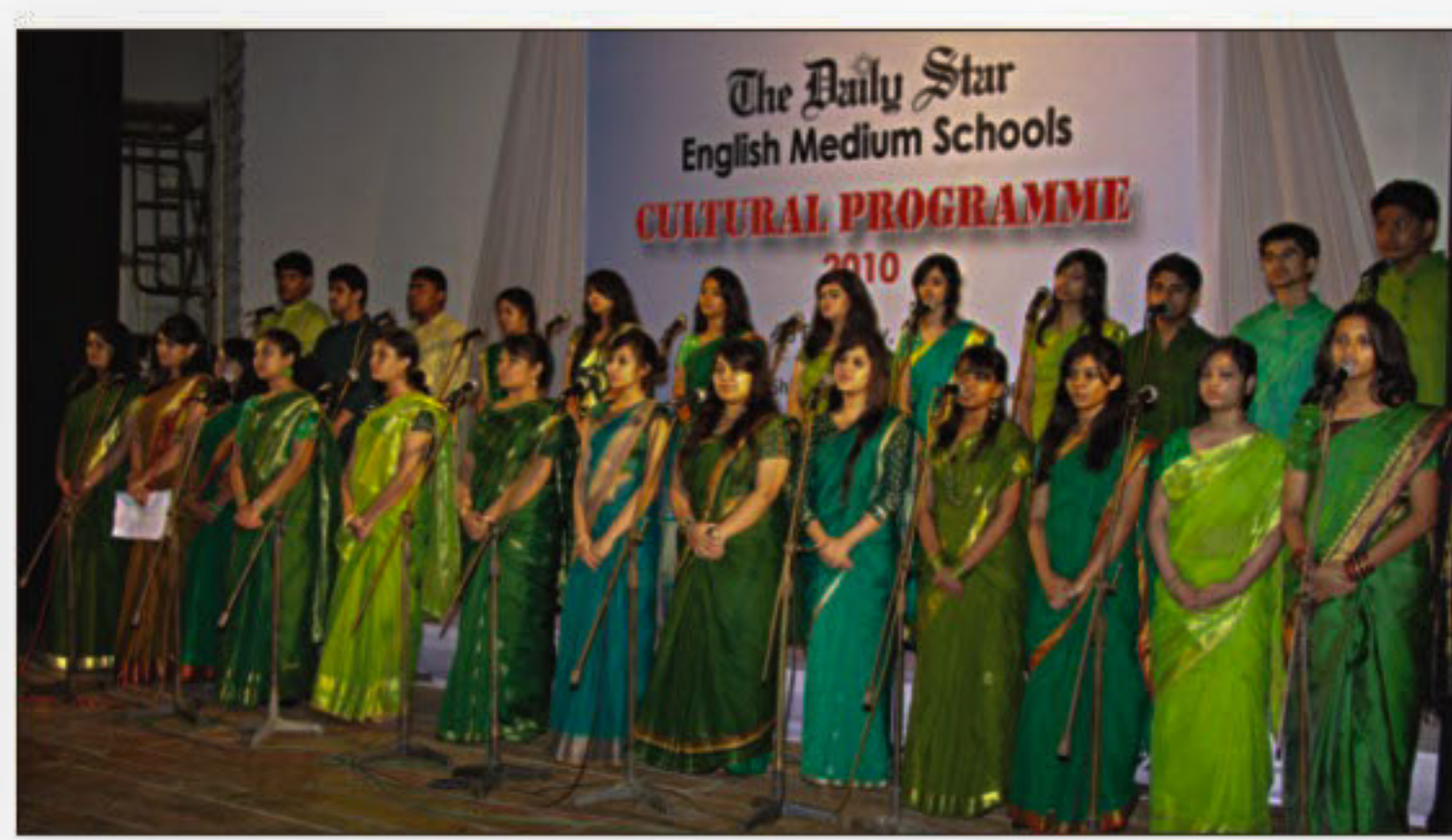
Commemorating Amar Ekushey On Channel i at 4:30 pm The Daily Star Dhaka English Medium Schools Cultural Programme, 2010

09:00 K1 World Grand Prix 2009 - Seoul - Final 16 11:00 FIM Mx3 World Championship 2009 - Highlights 11:30 Game 12:00 Mobil 1 The Grid 12:30 Simply The Best 01:00 Maybank Malaysian Open 04:00 Nike Football Locker Room 2009/10 04:30 KFC Malaysia World Band Competition 2009 - Highlights 05:30 Almost Anything Goes 06:00 Golf Focus 2010 06:30 TNA Sikander 09/10 07:30 F1 Classics - 1995 Belgian Grand Prix 08:30 Ace 2010 09:00 Behind The Baseline 10:30 Score Tonight 11:00 TNA Sikander 09/10