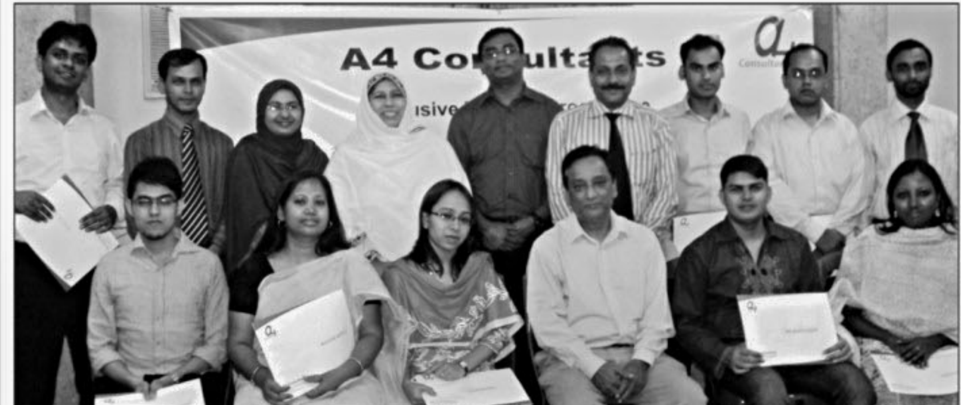
Participants of a training programme on fundamental human resource management and development pose for photograph with the guests at a certificate distribution ceremony at the training centre of A4 Consultants in the city recently. A4 Consultants organised the training course.

Apart from the report, CARDMA has conducted some awareness programme as part of the observance such as holding rallies, exhibition of paintings by children.