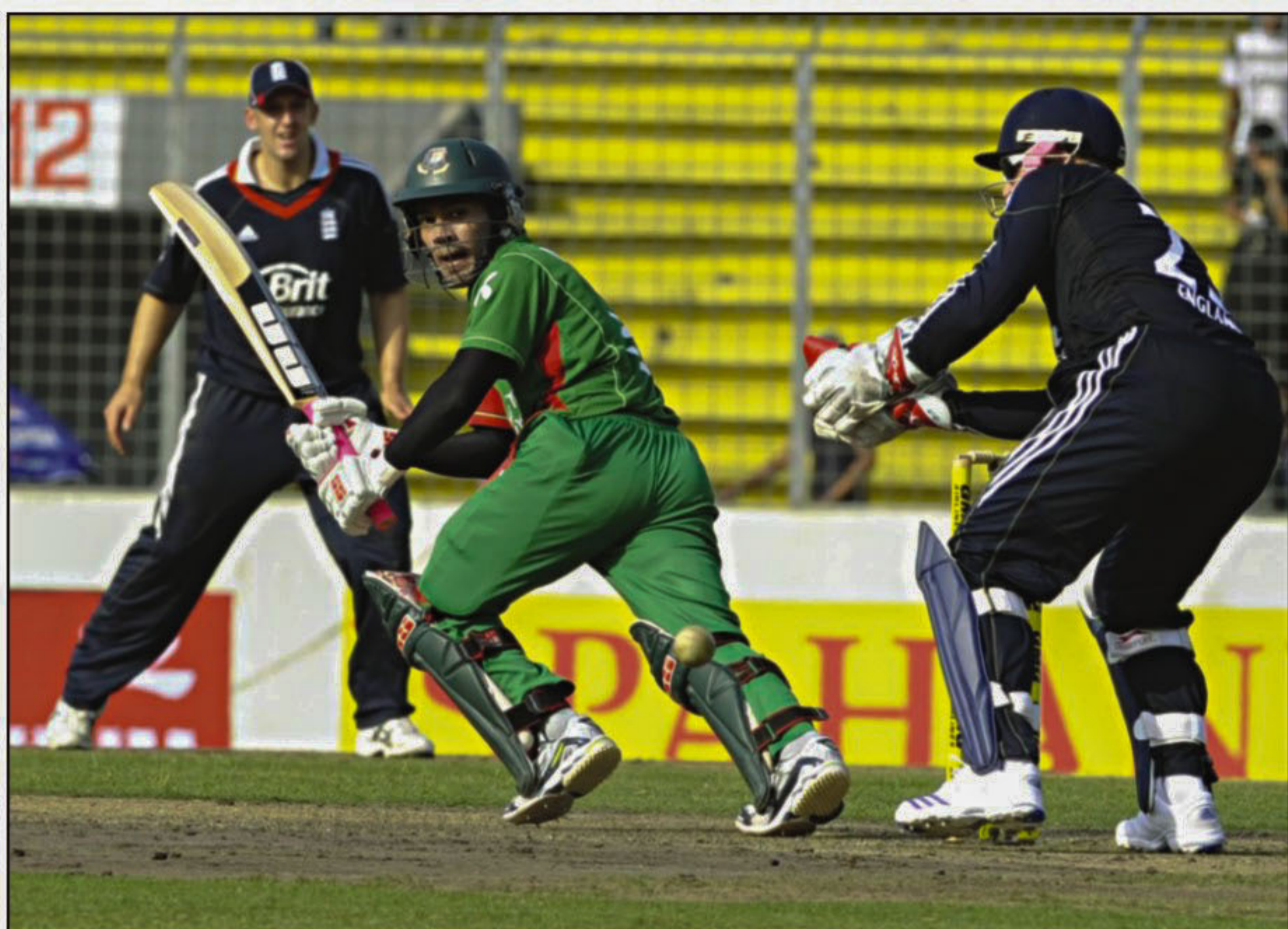
Bangladesh batsman Mushfiqur Rahim, who scored team highest 76, here flicks one towards fine-leg during the second one-day international against England at the Sher-e-Bangla National Stadium in Mirpur yesterday.