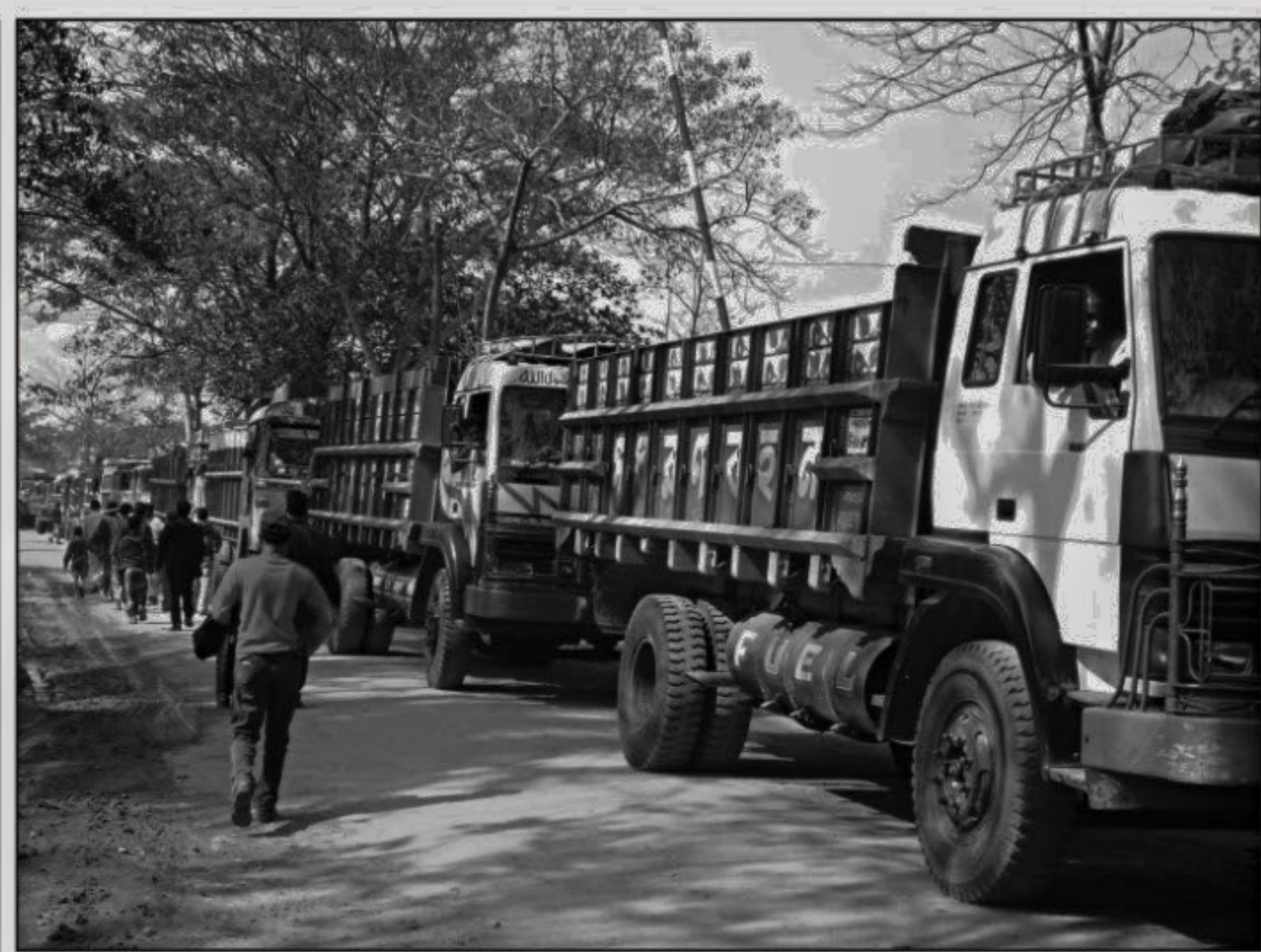
Trucks in a long queue lie stranded as export-import through Akhaura land port remained suspended following a transport strike at Agartala in the Indian state of Tripura since yesterday morning.

"The health director interviewed me over the allegations that came through an anonymous letter. Those who are envious at the development works under my leadership are circulating propaganda against me," he said.