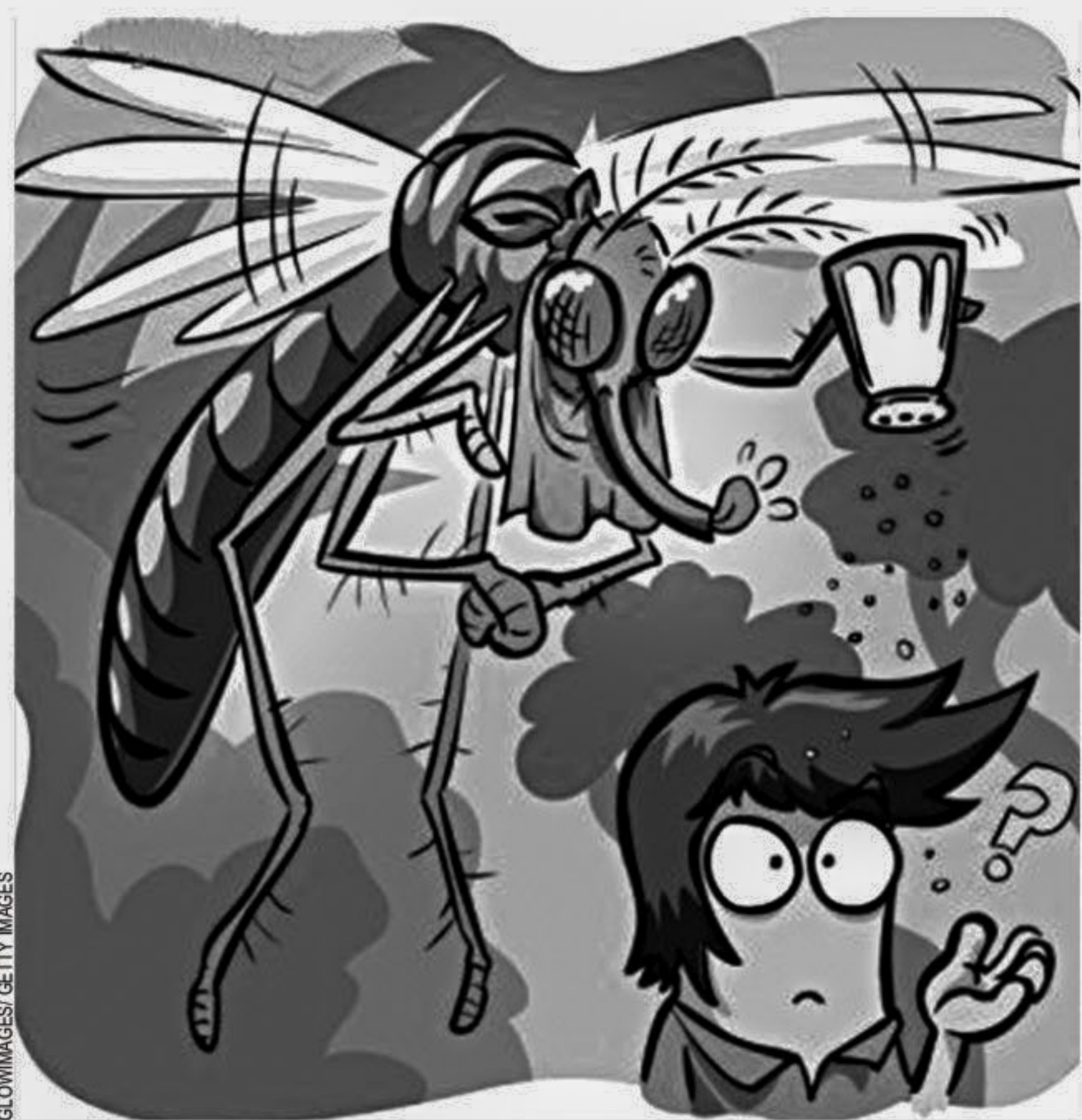
Competing with sound bites from ministers.

Turn to the Chittagong Hill Tracts, where fires have razed homes and murdered souls. In the hearts of those who have seen their dreams go up in smoke, there is a fire that can only leap higher in fury if we do nothing to reassure the adivasis that their homes and their land will be safe from here