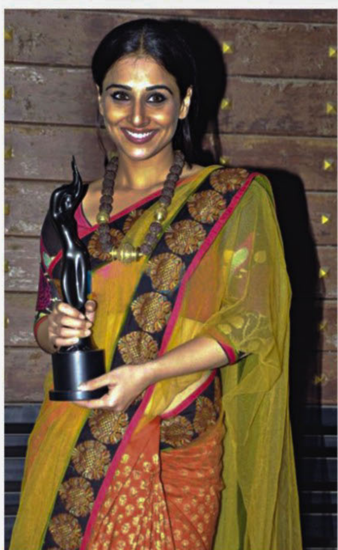
Vidya Balan with her Filmfare Award.

The 55th Idea Filmfare Awards event was hosted by Karan Johar, Shah Rukh Khan and Saif Ali Khan.