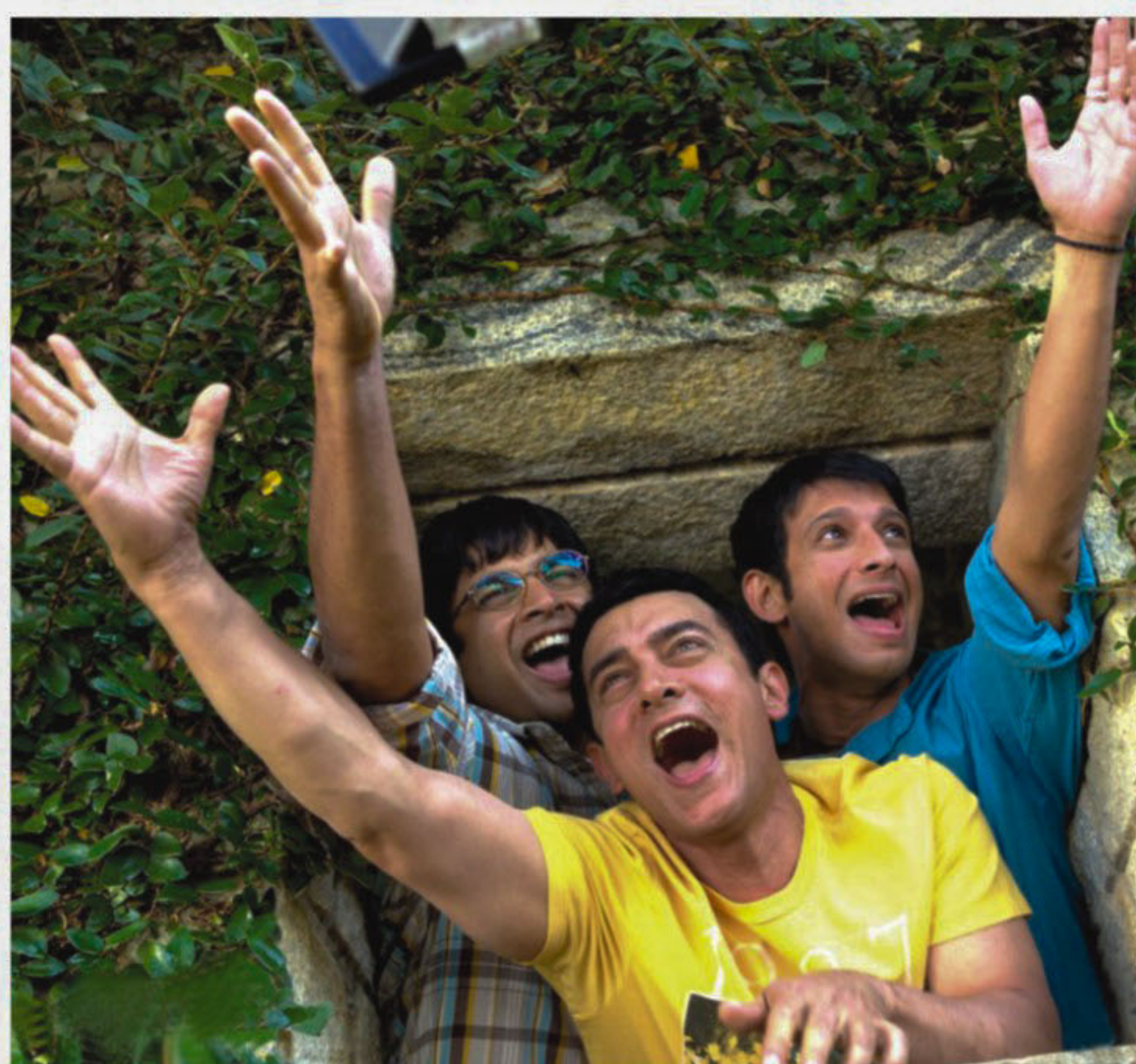
"3 Idiots", directed by Rajkumar Hirani and starring Aamir Khan, won top awards.