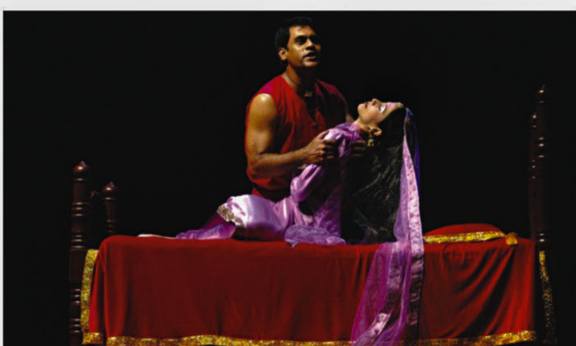
Natyakendra will stage its production "Dalim Kumar" at the festival.