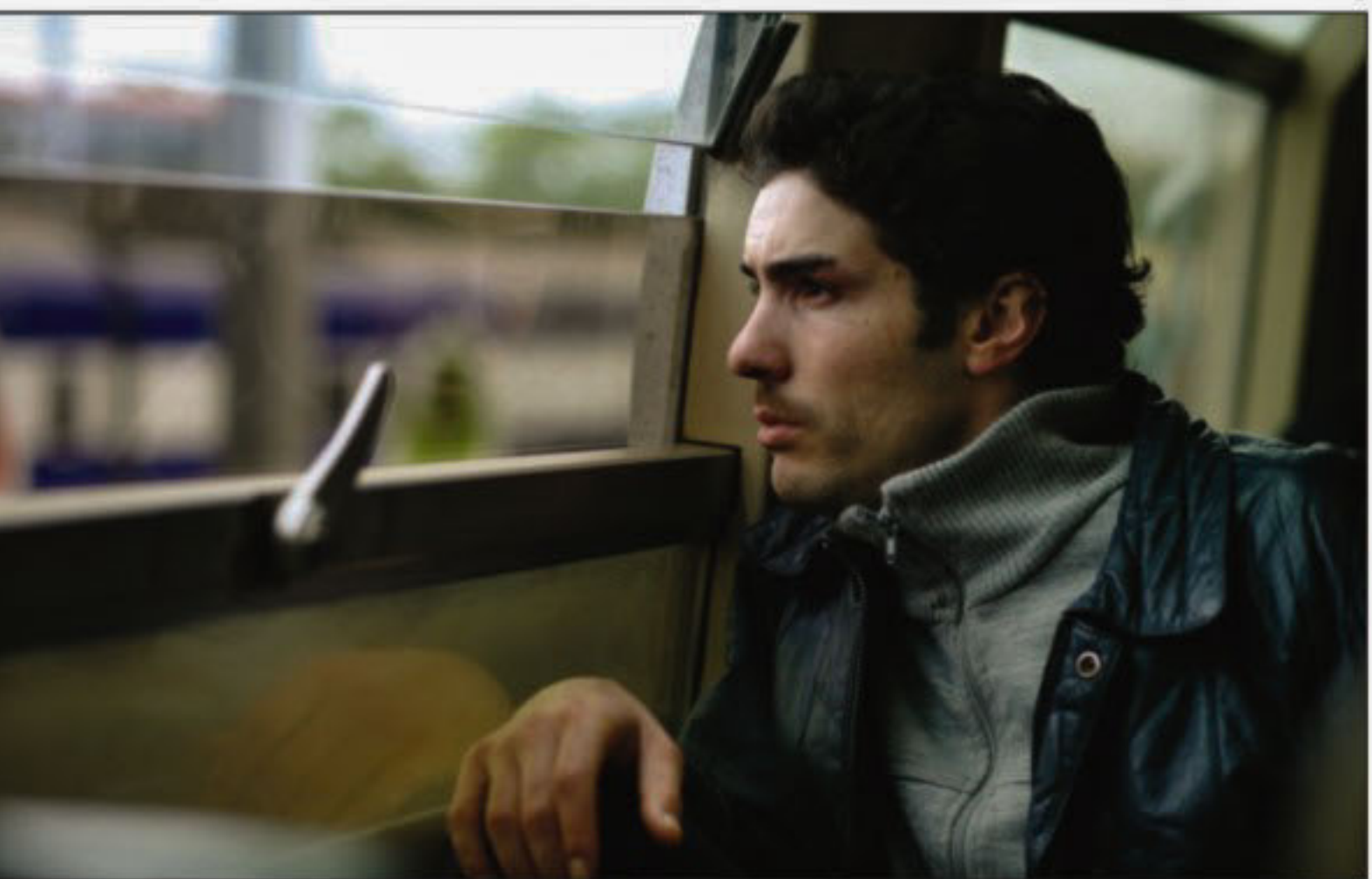
Relatively unknown actor Tahar Rahim won best actor for his role as a jailed French-Arab youth in "A Prophet".