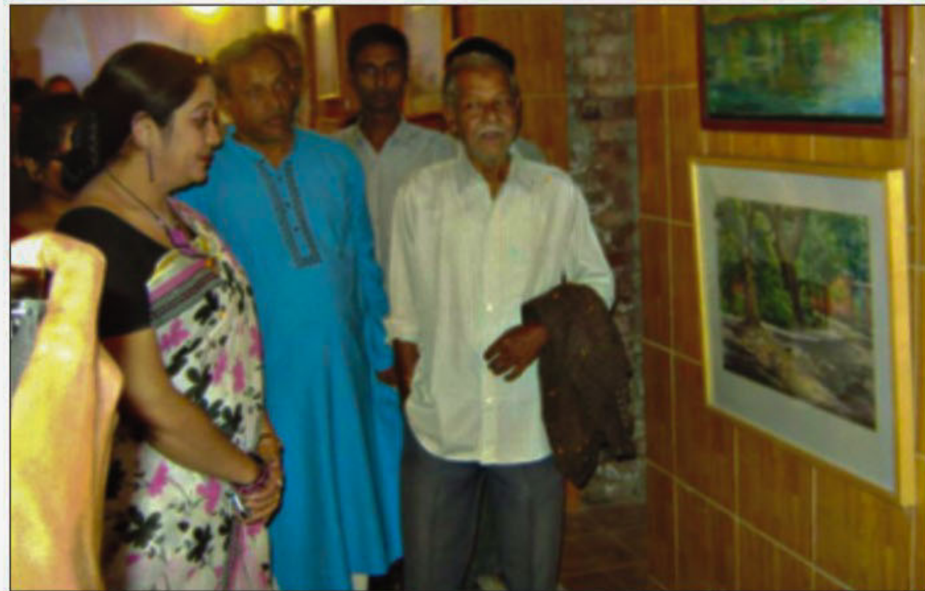
Guests at the painting exhibition.

A painting competition for children and a workshop are other highlights of the exhibition. The competition was held yesterday, while the