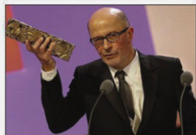
French director Jacques Audiard gives a speech after receiving the award for best director.

The drama follows an illiterate French-Arab youth as he rises through