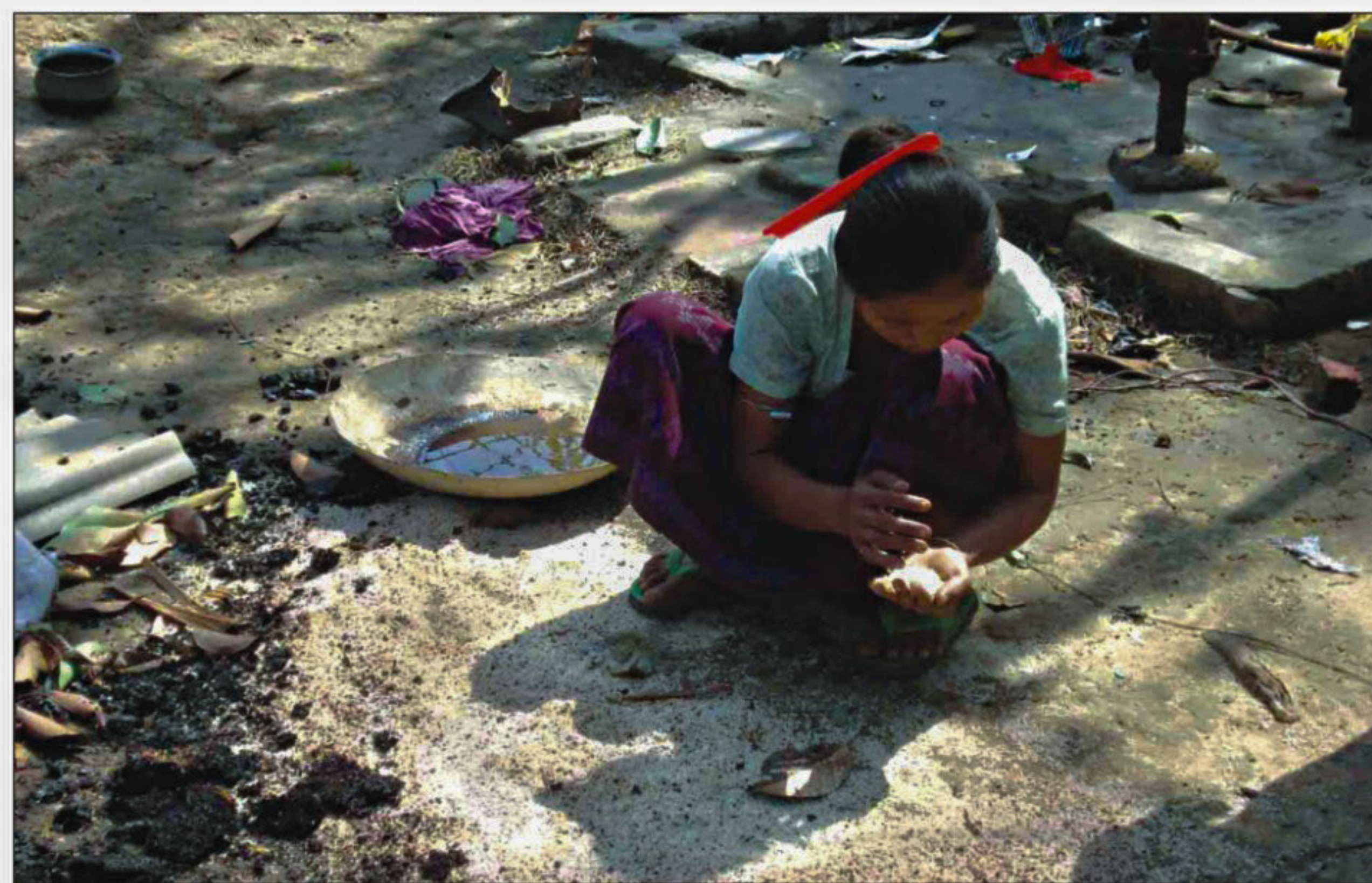
An indigenous woman gathers burnt rice from the ground where her house used to be before Bangalee settlers set it on fire Tuesday last. The photo was taken yesterday at Satbaiyapara in Khagrachhari.

SPORTS REPORTER Bangladesh will take on visiting England in the first one-day at the Sher-e-Bangla National Stadium tomorrow. The first of the three-match series will be a day-nighter as will be the second match at the same venue. The third game will be a day match in Chittagong. This is the second home series for Bangladesh against England. The last time the Englishmen toured was back in 2003 where they won both the Tests and one-dayers. There is only one survivor in the English side from that tour in Paul Collingwood while Bangladesh too have one survivor in fast bowler Mashrafe Bin Mortaza who SEE PAGE 15 COL 3