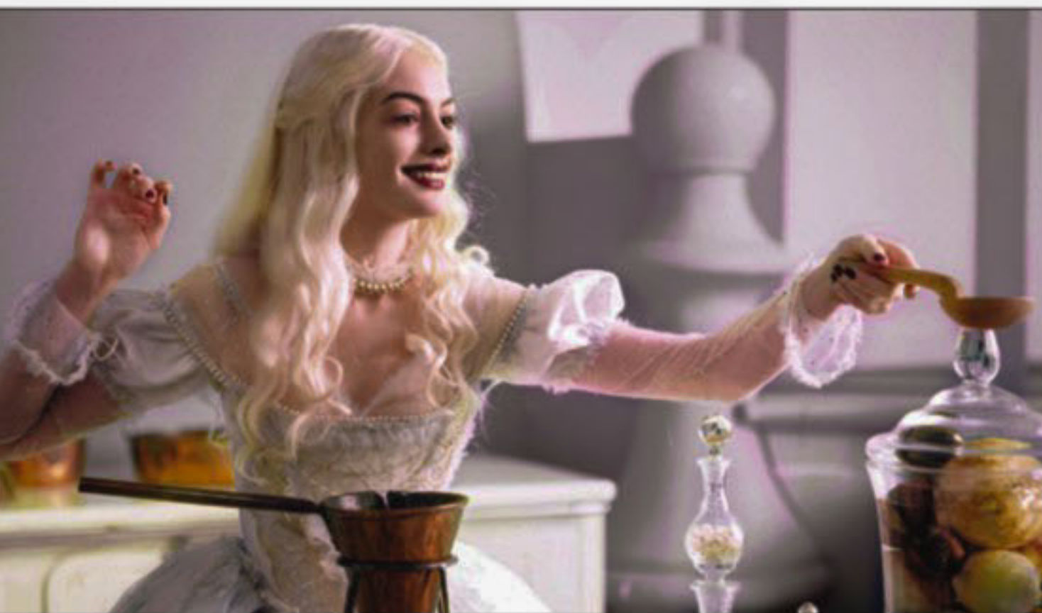
Anne Hathaway as the White Queen.

The visionary filmmaker behind "Edward Scissorhands" and "Charlie and the Chocolate Factory" has taken on the ultimate fantasy challenge -- turning Lewis Carroll's "Alice in Wonderland" into a 3-D spectacle that makes the familiar seem new again. Mia Wasikowska plays an older Alice, who once again falls into the rabbit hole and reunites with the bizarre creatures she met as a child.