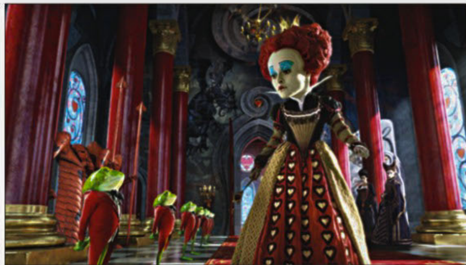
Helena Bonhan Carter as the Red Queen.

Audiences get a double dose of Matt Lucas, the star of the popular UK comedy sketch show "Little Britain" -- but