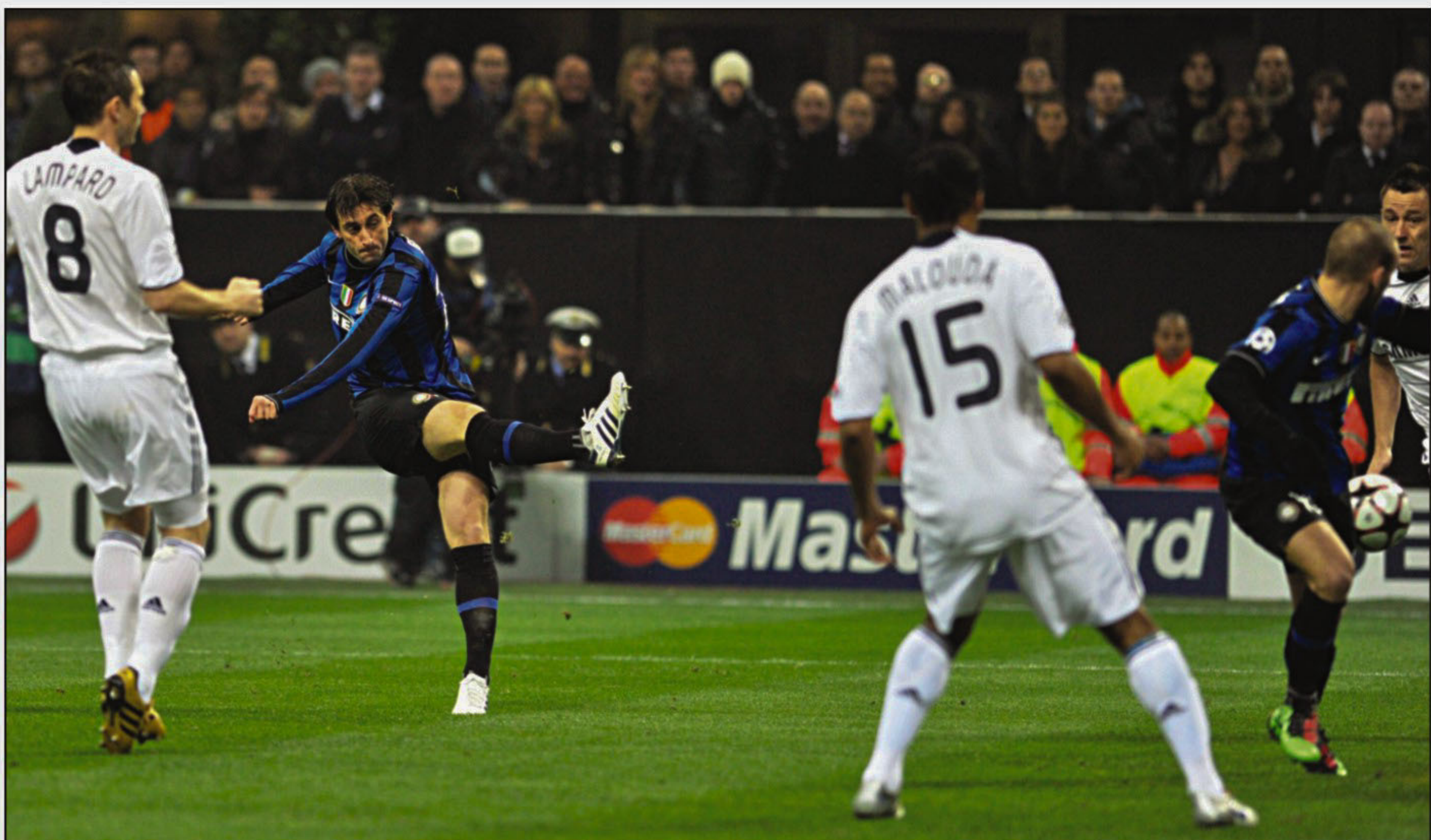
Inter Milan striker Diego Milito (2nd from L) shoots to score the opening goal against Chelsea during their Champions League encounter at San Siro on Wednesday.

With first choice left-back Ashley Cole out with an injury, Bridge would have lined up alongside Terry in the England defence in Wednesday's friendly against Egypt at Wembley.