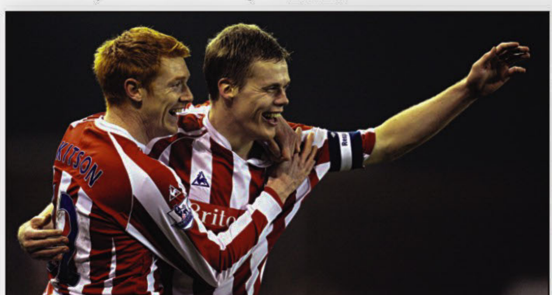
Stoke City defender Ryan Shawcross (R) celebrates his goal with teammate Dave Kitson during their FA Cup fifth round replay against Manchester City at the Britannia Stadium on Wednesday.

Reading - who knocked Liverpool out of the competition in the third round - reached the last eight for the first time since 1927 thanks to a Gyfi Sigurdsson winner in the fifth minute of extra time.