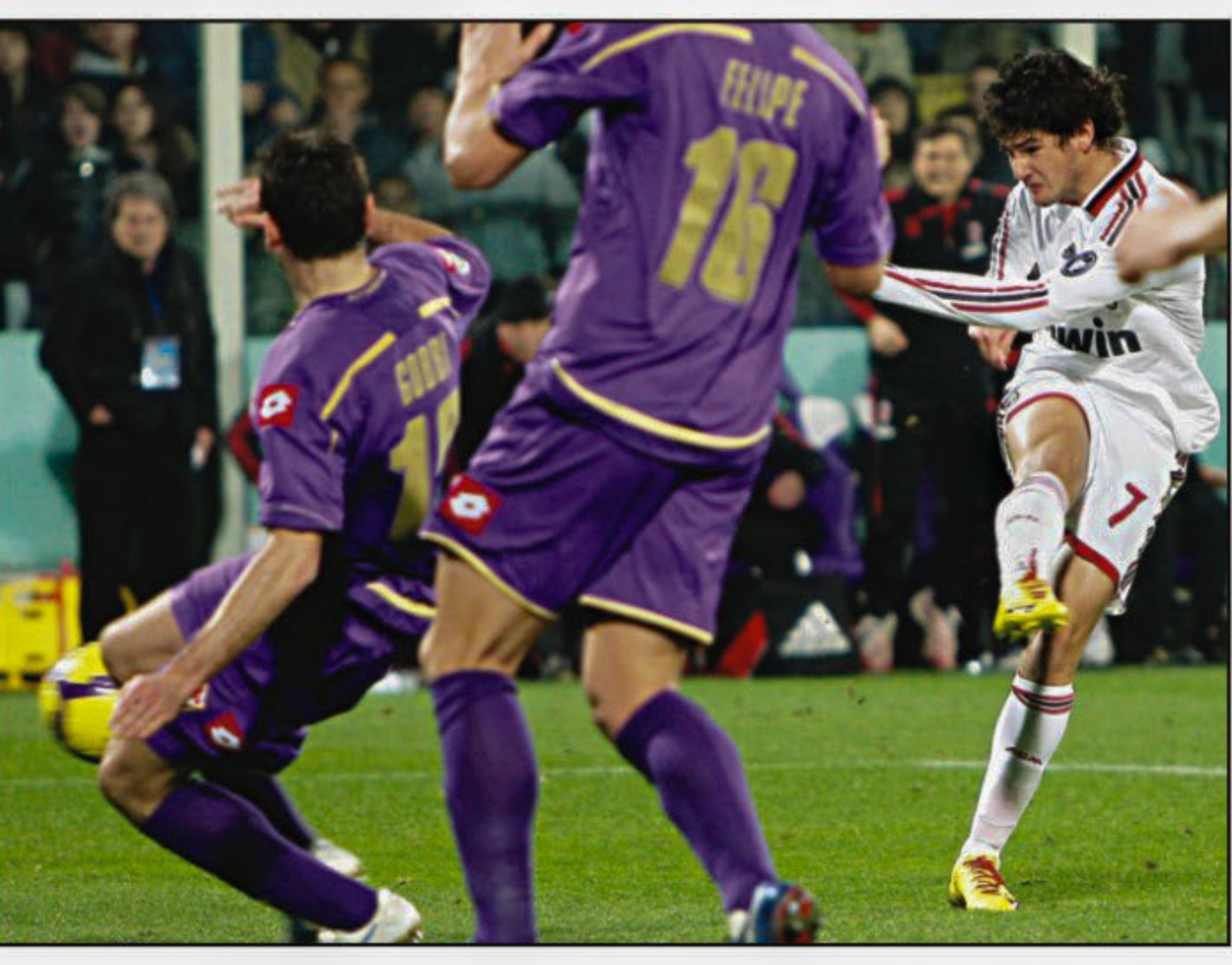
Milan striker Alexandre Pato (R) scores the winning goal against Fiorentina during their Serie A clash at the Artemio Franchi Stadium on Wednesday.

In the day's other game Sardinians Cagliari missed the chance to go fourth as they were beaten 2-1 at lowly Udinese.