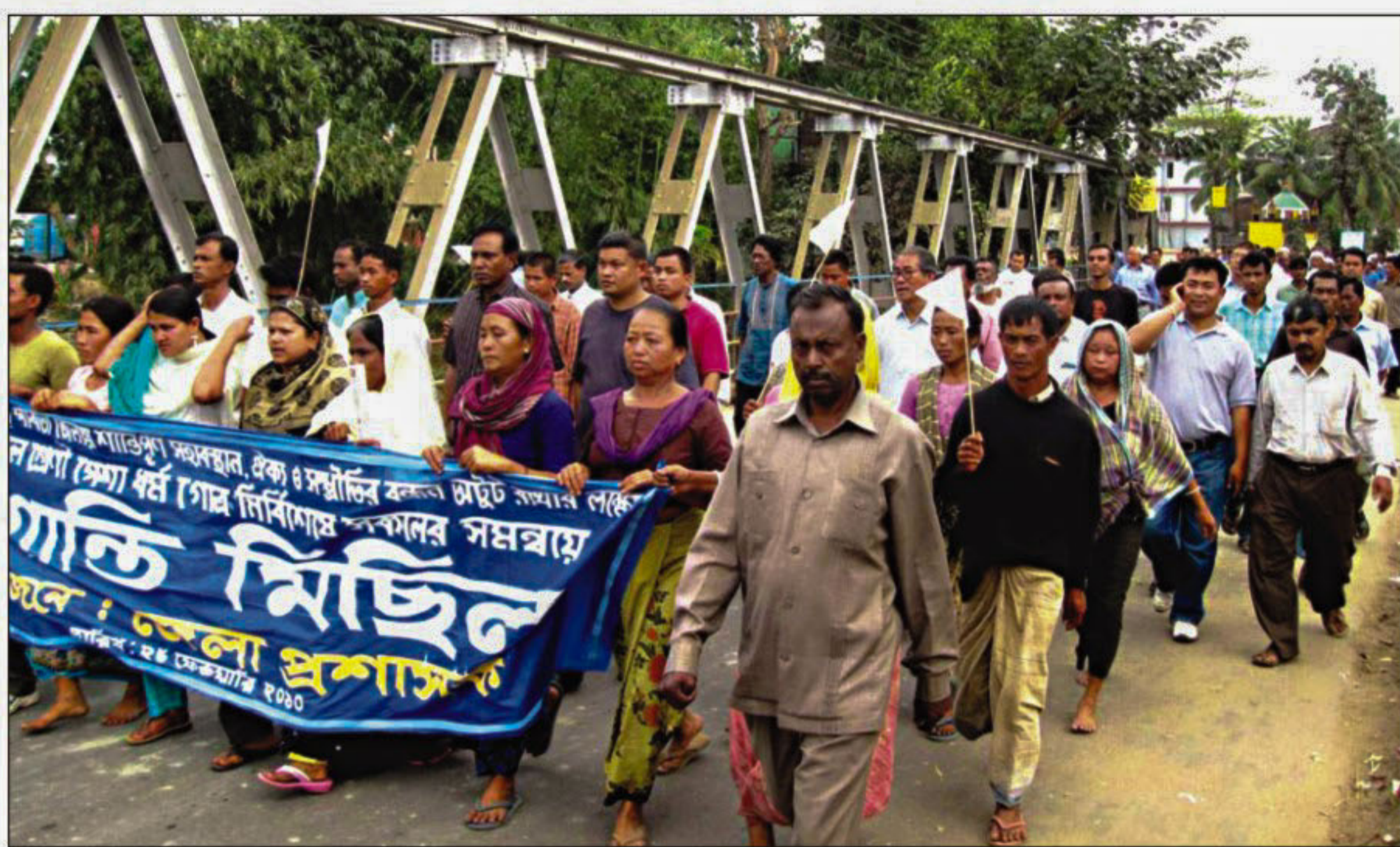
ADMIN'S INITIATIVE FOR CALM: People of the indigenous community yesterday bring out a peace rally at Khagrachhari, organised by the district administration, following violence over the last few days between Bangalee settlers and the indigenous people.