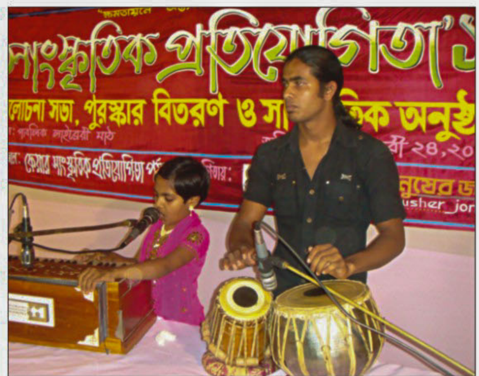
A young singer performs at the programme.

A congregation of parents of Harijan and the mainstream children also created a hope of purging social and class discrimination among the people.