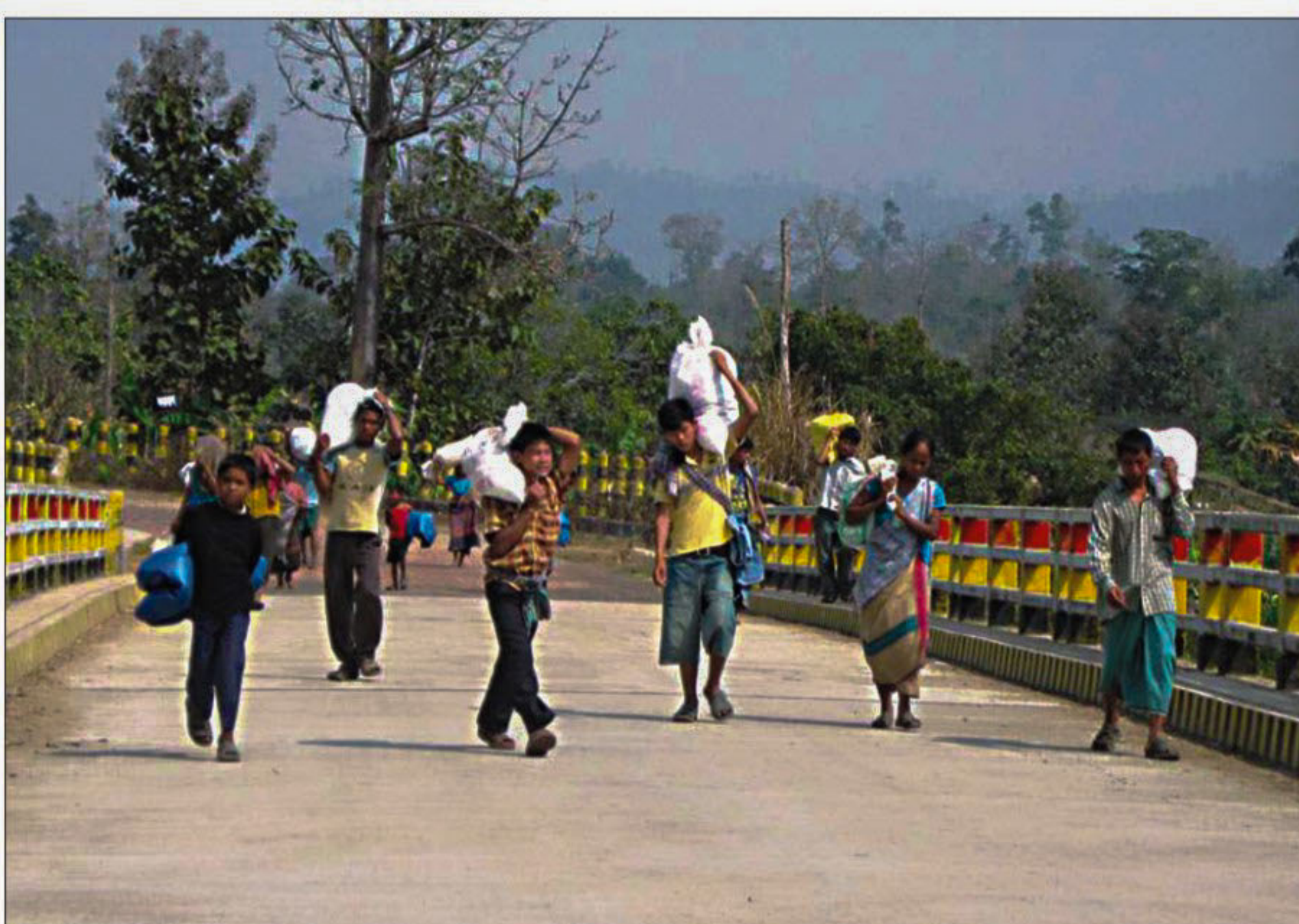
Indigenous people return home after receiving aid from Gangaram Mukh area in Rangamati yesterday.

EMRAN HOSSAIN and JASIM MAJUMDER, from Khagrachhari Ethnic violence in Khagrachhari resumed late last night after a day long eerie calm in the district town, six days into the start of gory clashes between Bangalee settlers and the adivasi communities in Chittagong Hill Tracts. Around 10 at night seven houses in adivasi neighbourhood of Golabari, and five houses of Bangalee settlers in Mollah Para and Ganj Para were set on fire. The flames were licking the night sky while electricity supply in the town was cut off. Screams, yells, wailings, and sirens of rushing fire trucks were filling the air amid a curfew that went into effect at 10:00pm, scheduled to be lifted at 7:00am today. Although section 144 remains in effect banning any demonstration during the curfew-free hours today as well, Parbatya Bangalee Chhatra Parishad, a student organisation of Bangalee settlers, announced a daylong transport strike in all three hill districts for the day. All through yesterday government joint forces comprising SEE PAGE 15 COL 4