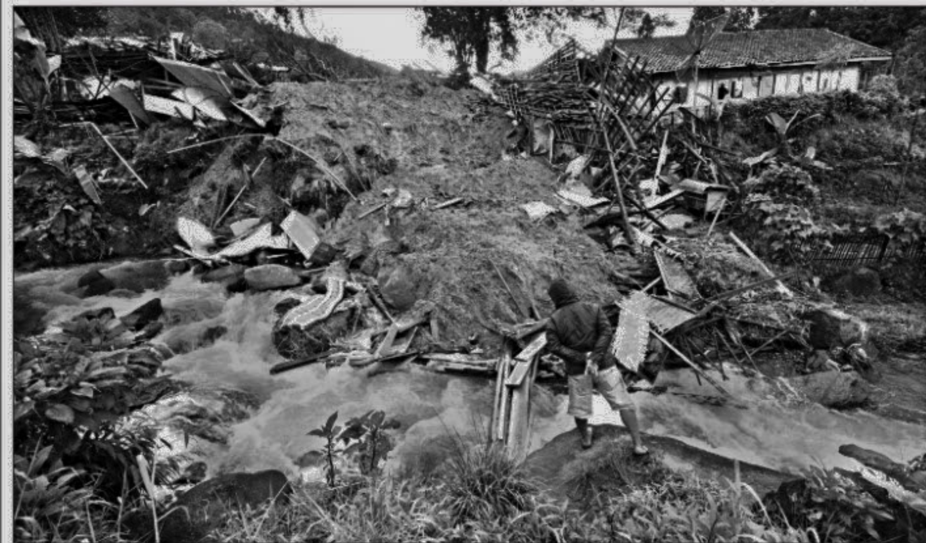
A villager looks at buried houses by a landslide at Dewata village in Pasir Jambu, West Java on Wednesday. Rescuers said that hopes were fading for more than 60 people missing after a landslide struck south of the capital Jakarta, killing at least 15 people.

The United States and European powers suspect Iran is enriching uranium to make nuclear weapons under cover of its civilian energy programme, a charge Tehran denies.