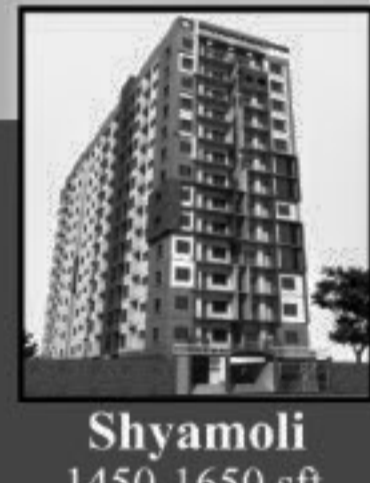
Shyamoli 1450-1650 sft