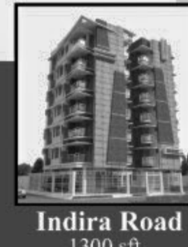
Indira Road 1300 sft