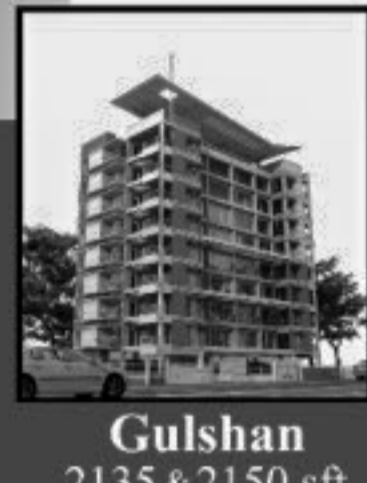
Gulshan 2135 & 2150 sft