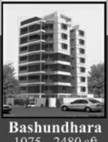
Bashundhara 1075 - 2480 sft