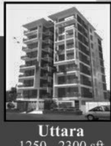
Uttara 1250 - 2300 sft