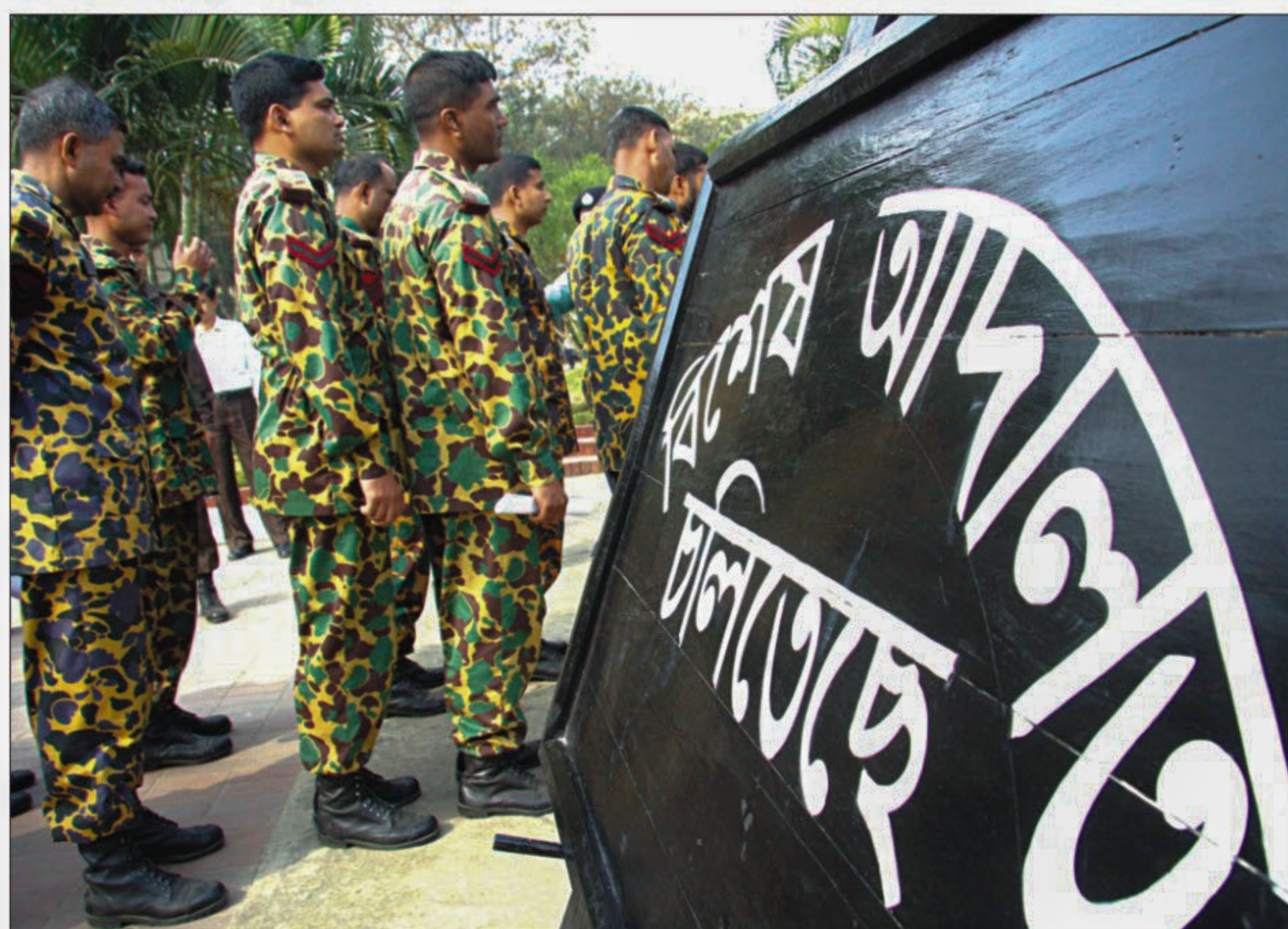
Accused border guards are being taken to a special tribunal set up at BDR Darbar Hall at Pilkhana in the city yesterday. (Story on Page 1)