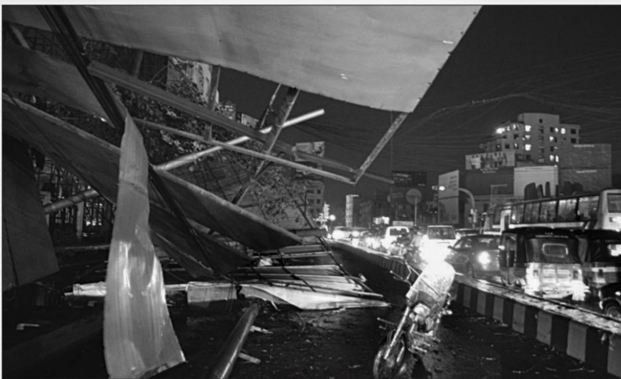
A billboard collapses in the middle of Bijoy Sarani during a hailstorm in the city yesterday. (Story on Page 16)