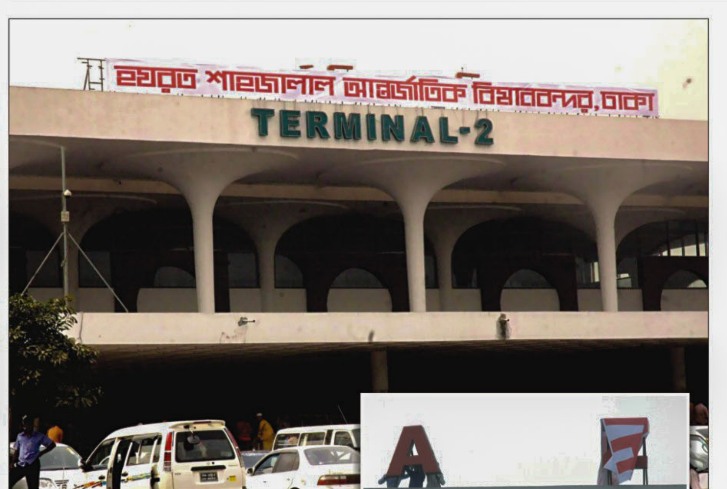
A plaque bearing the new name Zia international airport hangs on top of the Terminal 2 as the government has recently renamed it after Hazrat Shahjalal. Labourers lifting the letters of the new name, inset.

STAFF CORRESPONDENT Five foreign power companies yesterday submitted their documents to qualify for the 360megawatt Haripur gas-fired power project under the Electricity Generation Company of Bangladesh. The five companies are: Sumitomo along with Gsec from Japan, Marubeni Corporation from Japan, Guang Dong from China, Cobra from Spain and Ensald from Italy. In January, when the EGCB started selling the document outlining criterion, terms and conditions to pre-qualify for this SEE PAGE 15 COL 1