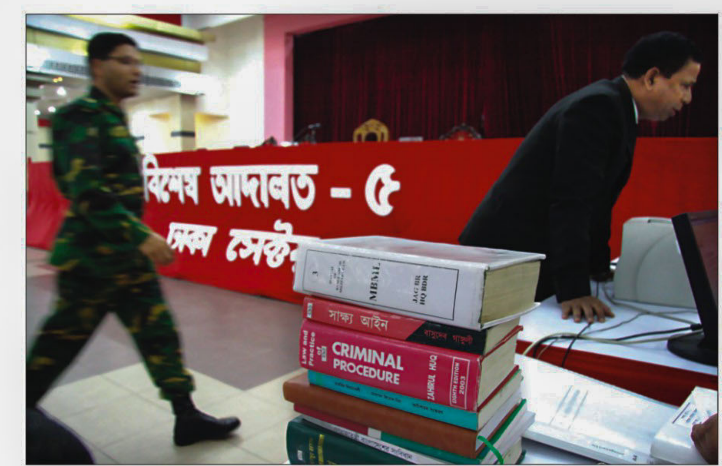
Officials preparing the Darbar Hall for the trial of the BDR mutiny on the same spot where the carnage began on February 25 last year.

51 percent in the original ADP. The cash budget support increased by 48 percent and stood at Tk 5,180 crore which is mostly provided by the Asian Development Bank and the World Bank. In the revised ADP, fund of the foreign-aided projects has been slashed by 12 percent (Tk 11,300 crore) due to their failure in implementation. The government's policy is to reduce the number of projects and lay more emphasis on implementation. But in the revised ADP, the number of projects is 1,058, which was 886 in the original one. Meanwhile, 464 projects have been kept without allocation in view of allocating fund to SEE PAGE 15 COL 4