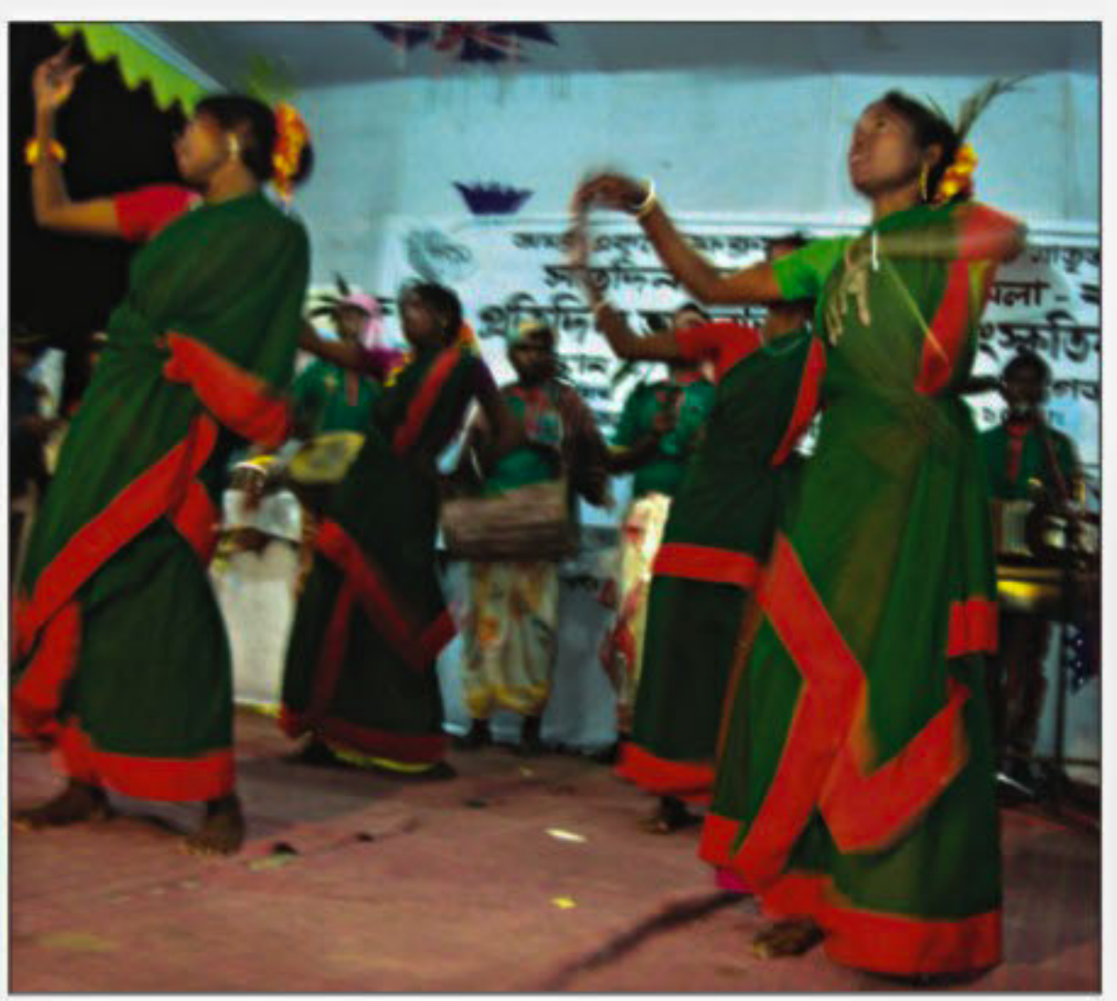
Adibashi artistes dance at the programme.