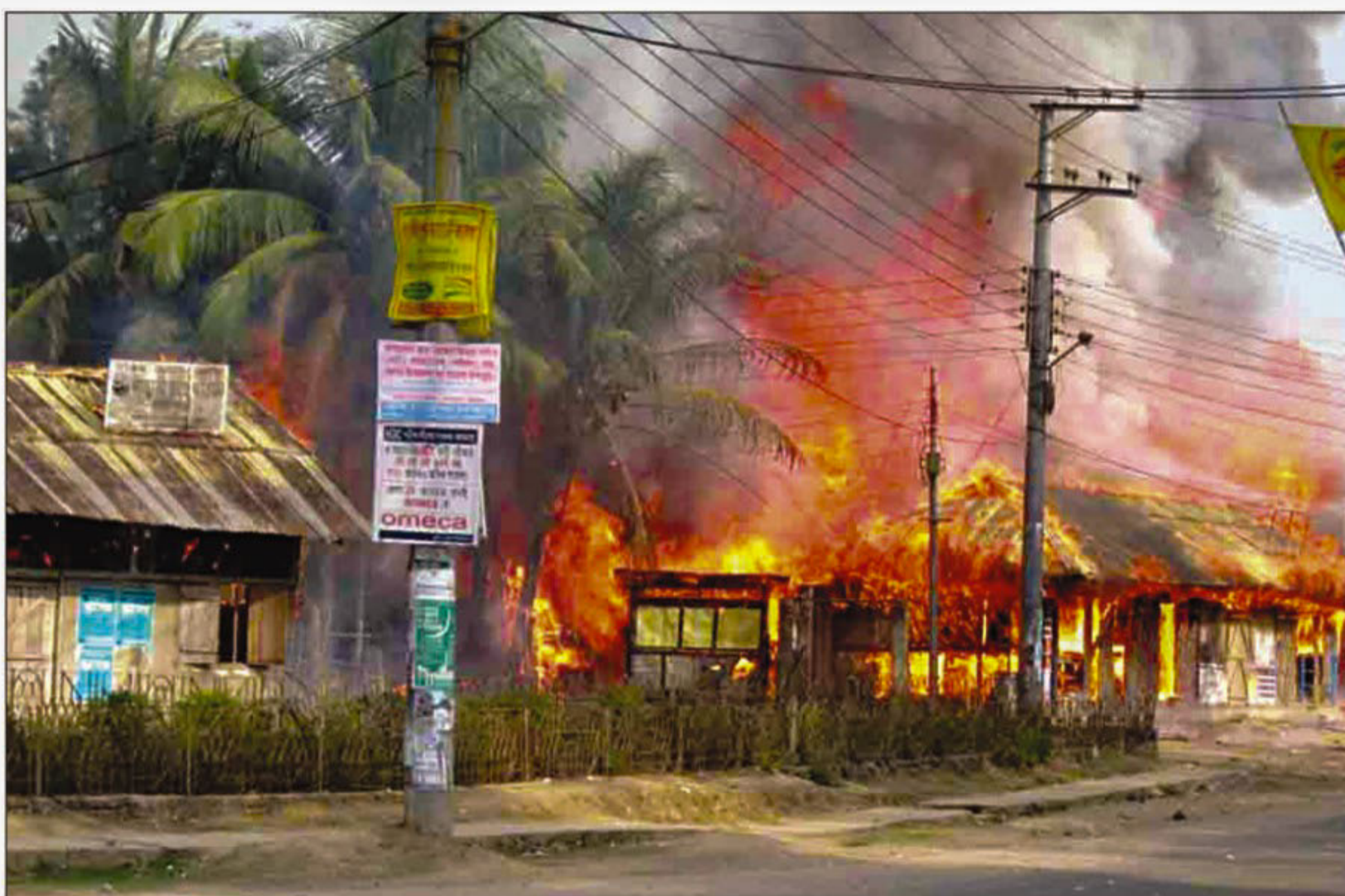
Houses of the ethnic people go up in flames as Bangalee settlers allegedly carried out an arson attack on Mahajonpara village in Khagrachhari yesterday.

Different political, social and rights organisations have expressed concern over the tense situation in Baghaichhari in Rangamati where two indigenous people have so far been killed during clashes with Bangalee settlers. Gonosanghati Andolan protested against the killings at its extended meeting of the central committee yesterday. They demanded punishment of those responsible and announced a protest rally at Muktangon in the capital at 4:00pm today. Leaders of the movement demanded that the government withdraw army from the hills and establish rights of the ethnic people. Association for Land Reform and Development