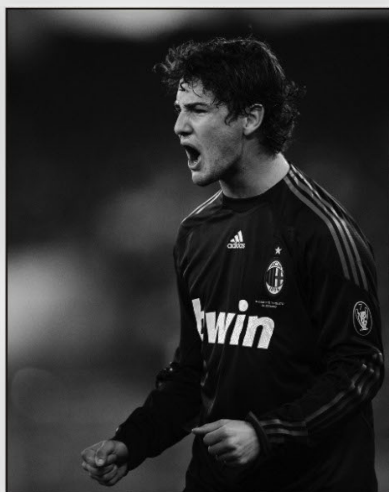
Milan striker Alexandre Pato is ecstatic after scoring against Bari during their Serie A clash at the San Nicola Stadium on Sunday.

Juve scored the winner completely against the run of play as Alessandro Del Piero slipped in substitute Antonio Candreva to score his first goal for the club.