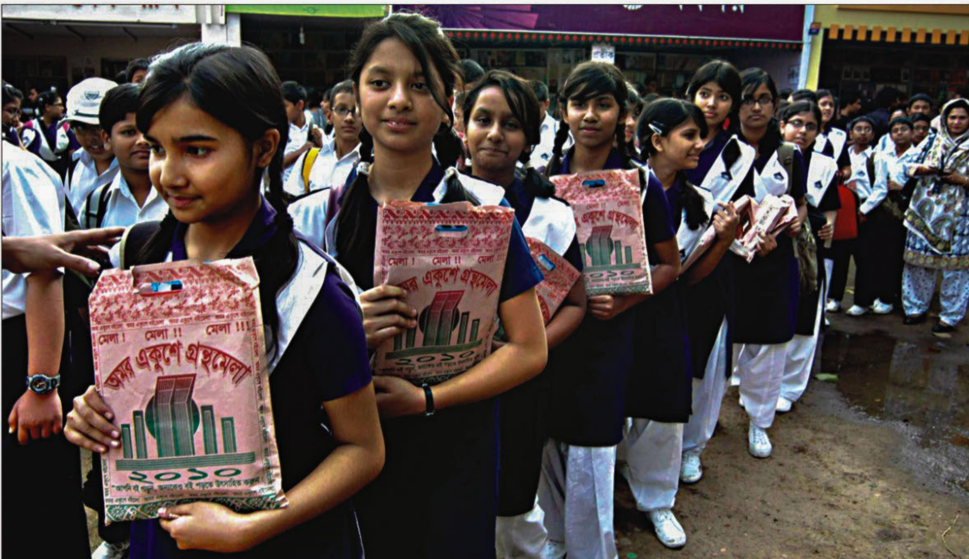
With new books in their hands, a group of students come out of the Bangla Academy in the city after their visit to the Ekushey Book Fair yesterday.