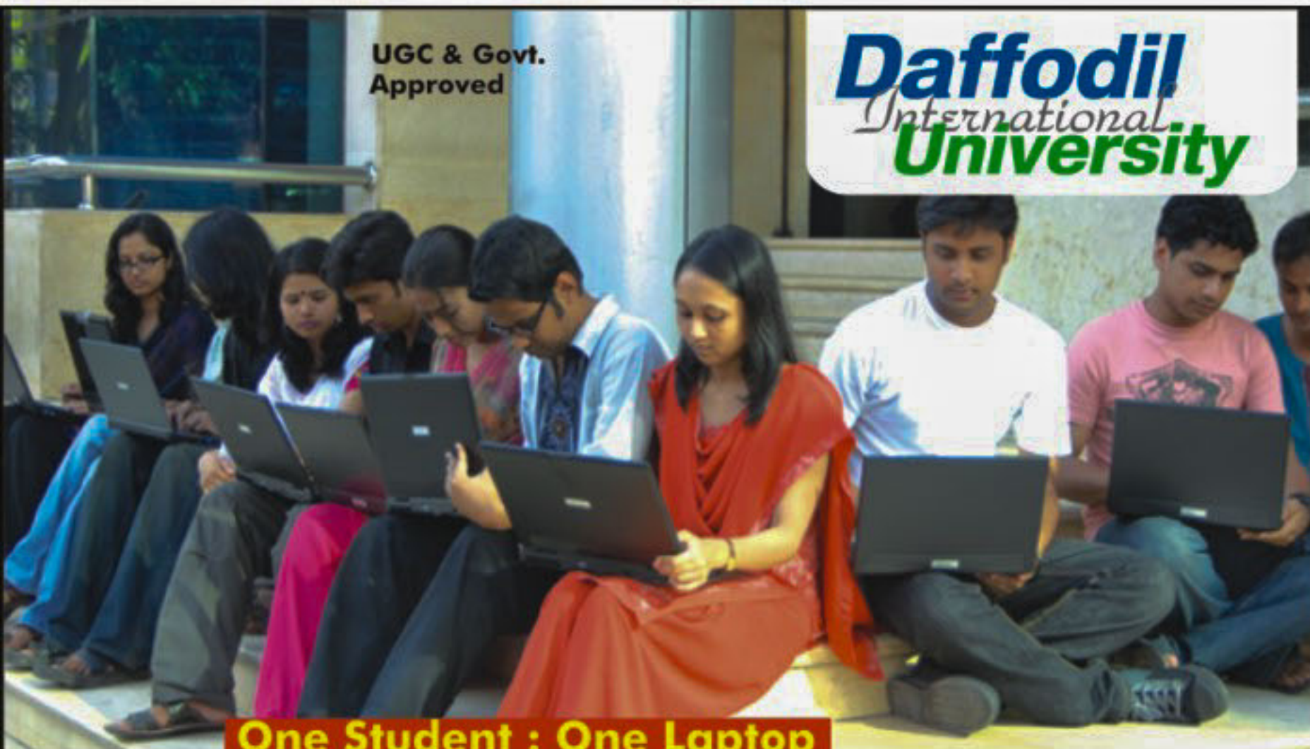
One Student : One Laptop

The minister also said that the government will hold the trial of war criminals and there is no doubt about it.