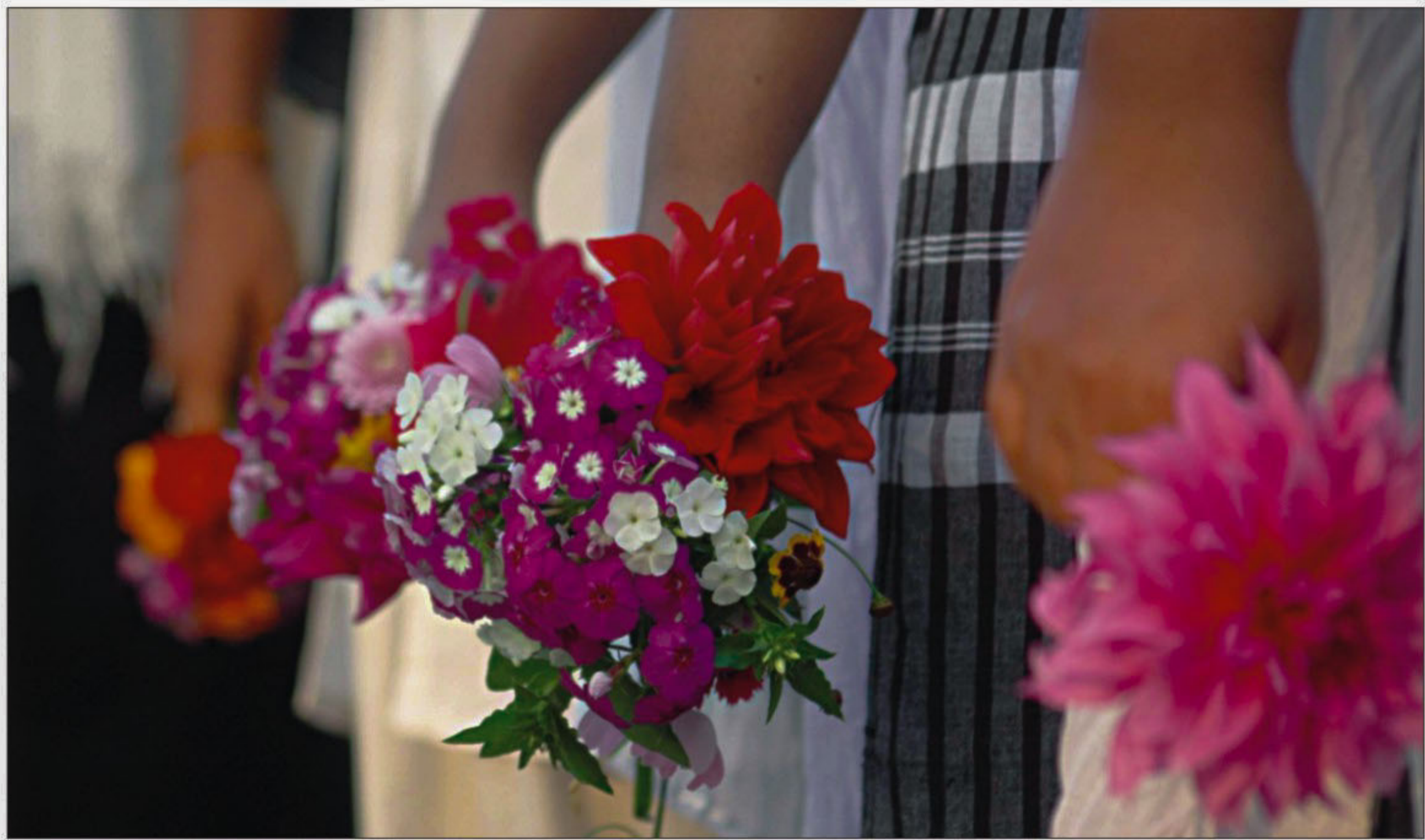
Women line up with flowers in hand to pay respect to language martyrs at the Central Shaheed Minar in Dhaka yesterday. Florists counted brisk sales in February, a month that saw three occasions: Pahela Falgun, Valentine's Day and International Mother Language Day.