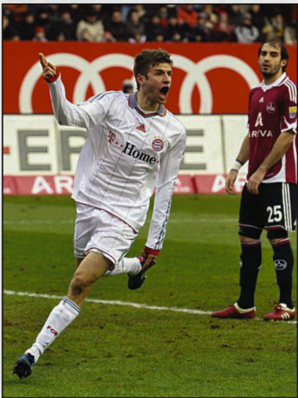
Bayern Munich starlet Thomas Mueller is ecstatic after netting in their Bundesliga match against local rivals Nuremberg on Saturday.

Nuremberg had one chance. They then played with all 11 players in their own half. We were very dominant and did everything well for 90 minutes, except for five seconds."