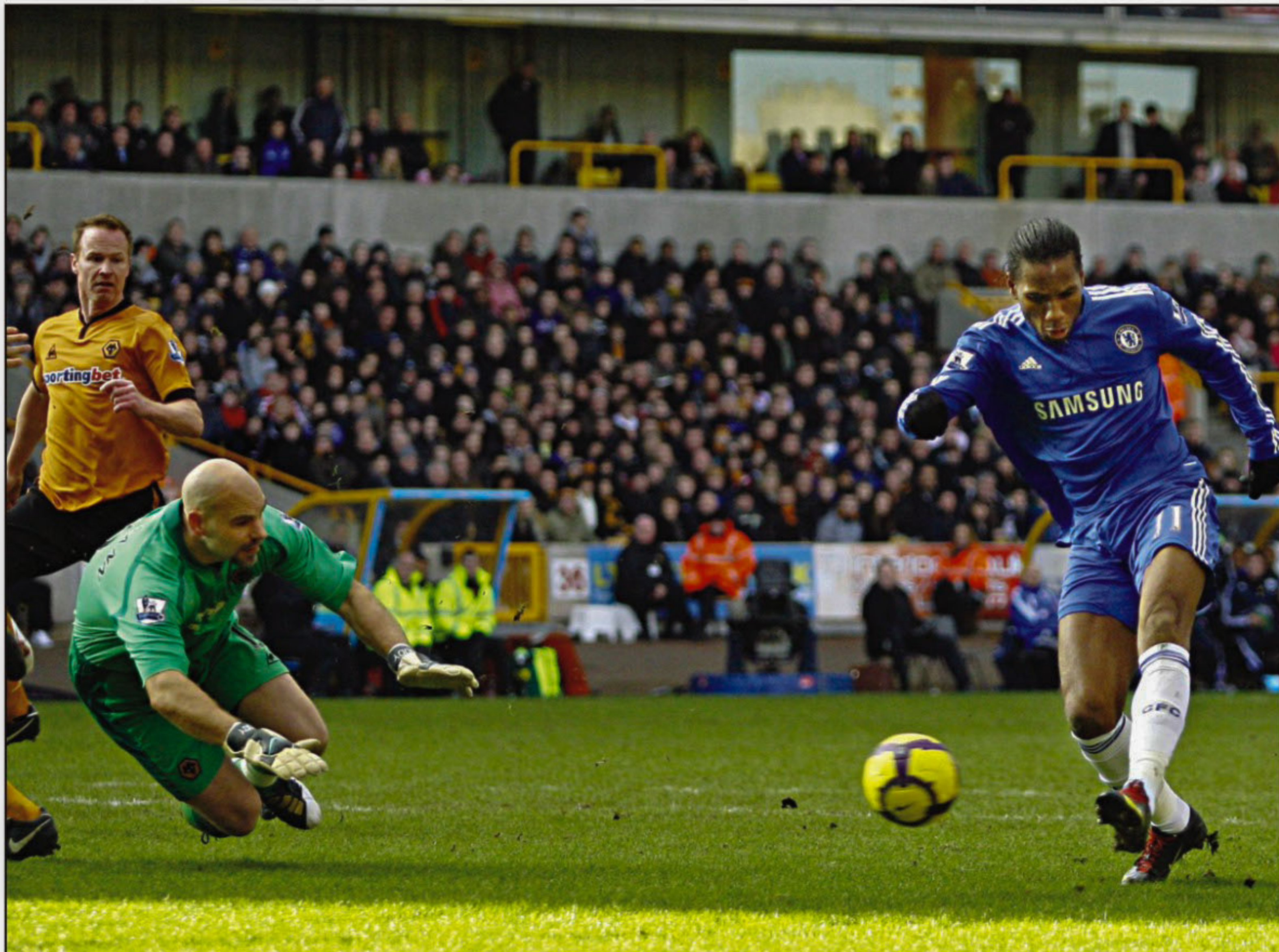
Chelsea striker Didier Drogba (R) thumps the ball past Wolverhampton Wanderers goalkeeper Marcus Hahnmann (L) to score his second goal in their Premier League match at Molineux Stadium on Saturday.

Julien Faubert had set up Cole's goal and he added West Ham's third himself in the 90th minute.