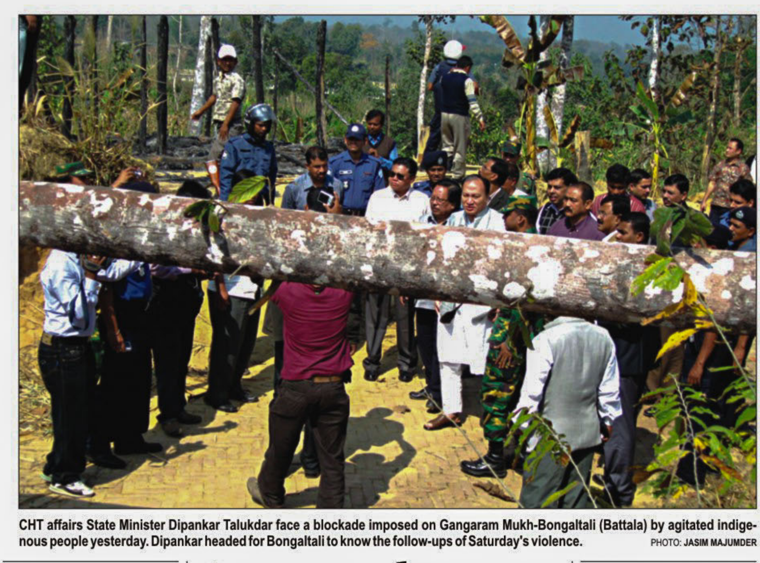
CHT affairs State Minister Dipankar Talukdar face a blockade imposed on Gangaram Mukh-Bongaltali (Battala) by agitated indigenous people yesterday. Dipankar headed for Bongaltali to know the follow-ups of Saturday's violence.