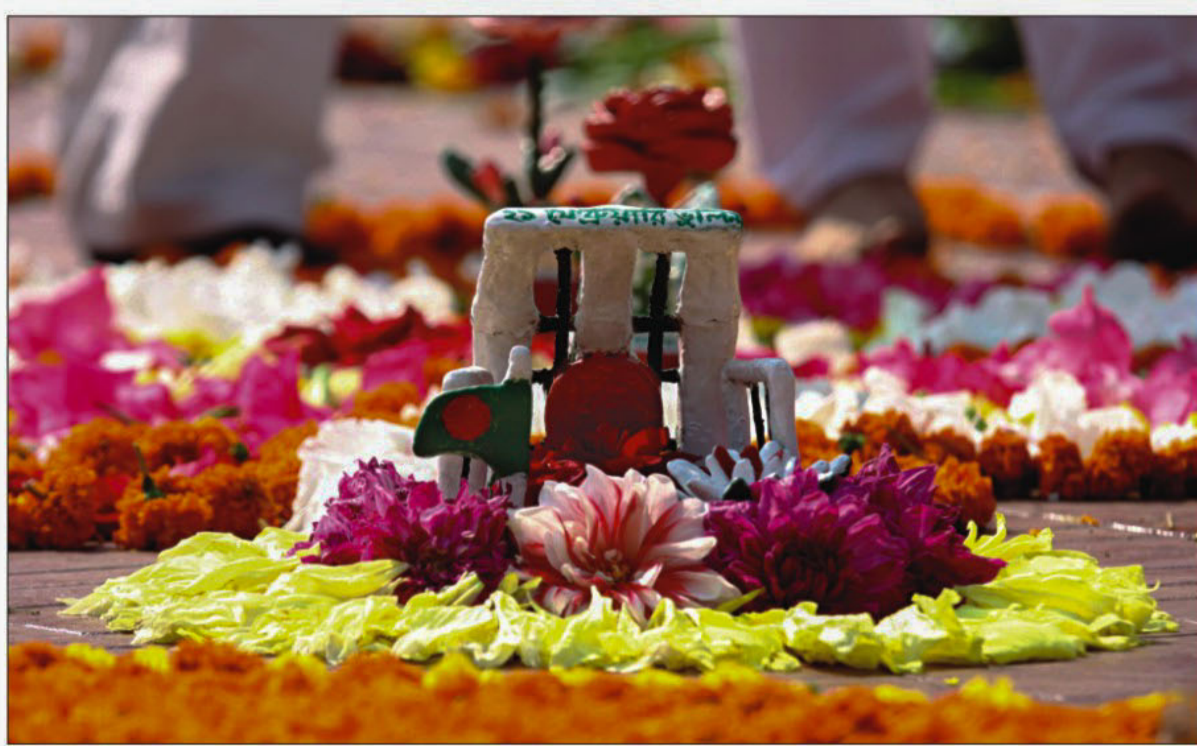
The colour of the roses and the miniature Shaheed Minar speak out: it's time to sing the mournful notes of the elegy: Ami Ki Bhulite Pari -- how could I forget February 21?