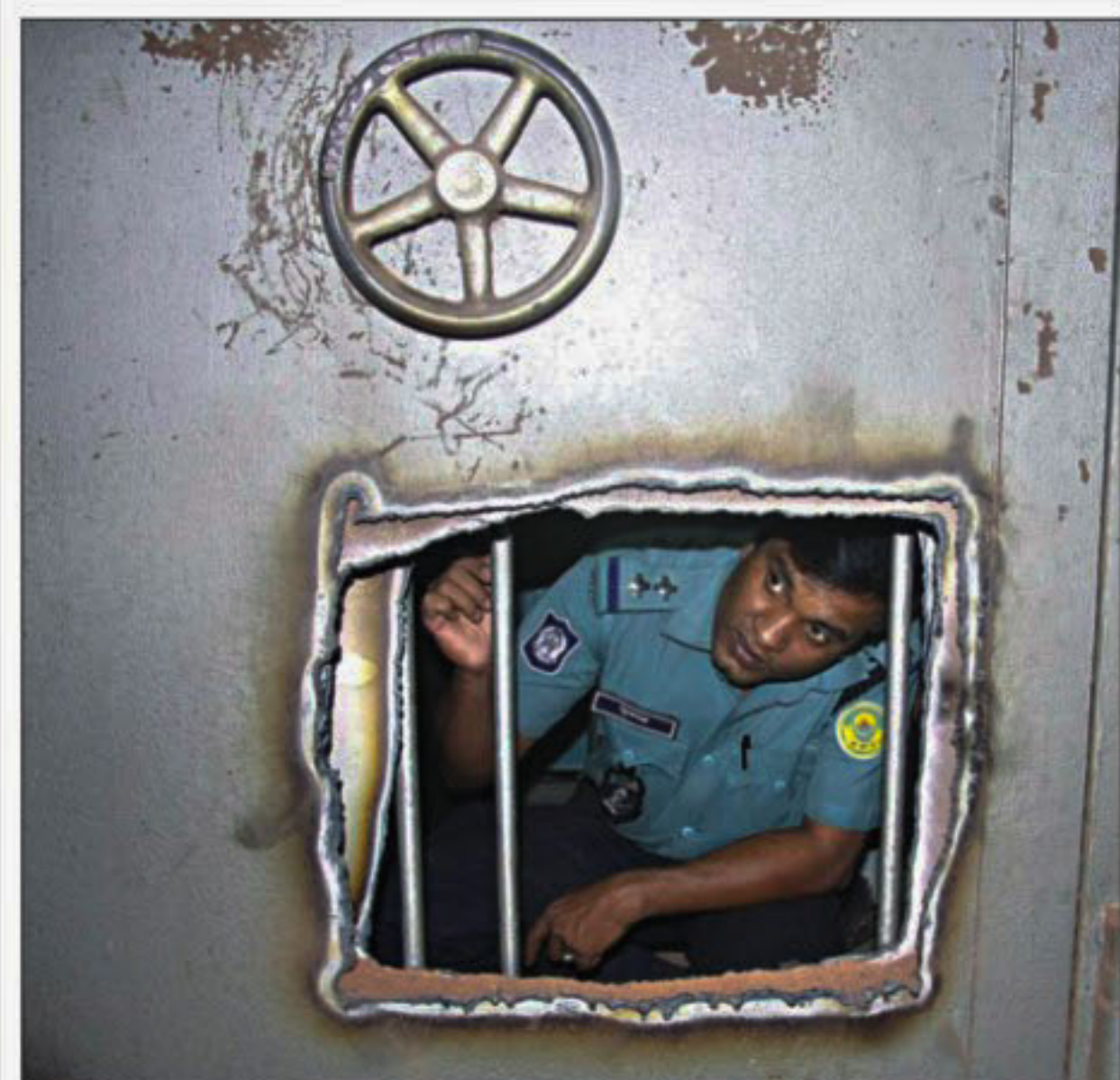
A gang using gas cutter broke in the strong room of Agrani Bank, Mehediabagh branch in Chittagong in the early hours of yesterday. Run out of gas, they failed to open the main locker. The photo was taken yesterday