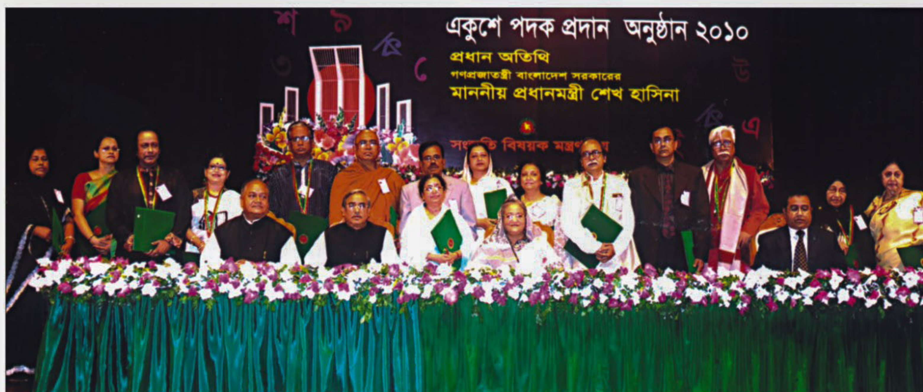
Prime Minister Sheikh Hasina along with distinguished personalities, who received the prestigious Ekushey Padak 2010, poses for a photograph at the city's Osmani Auditorium yesterday.