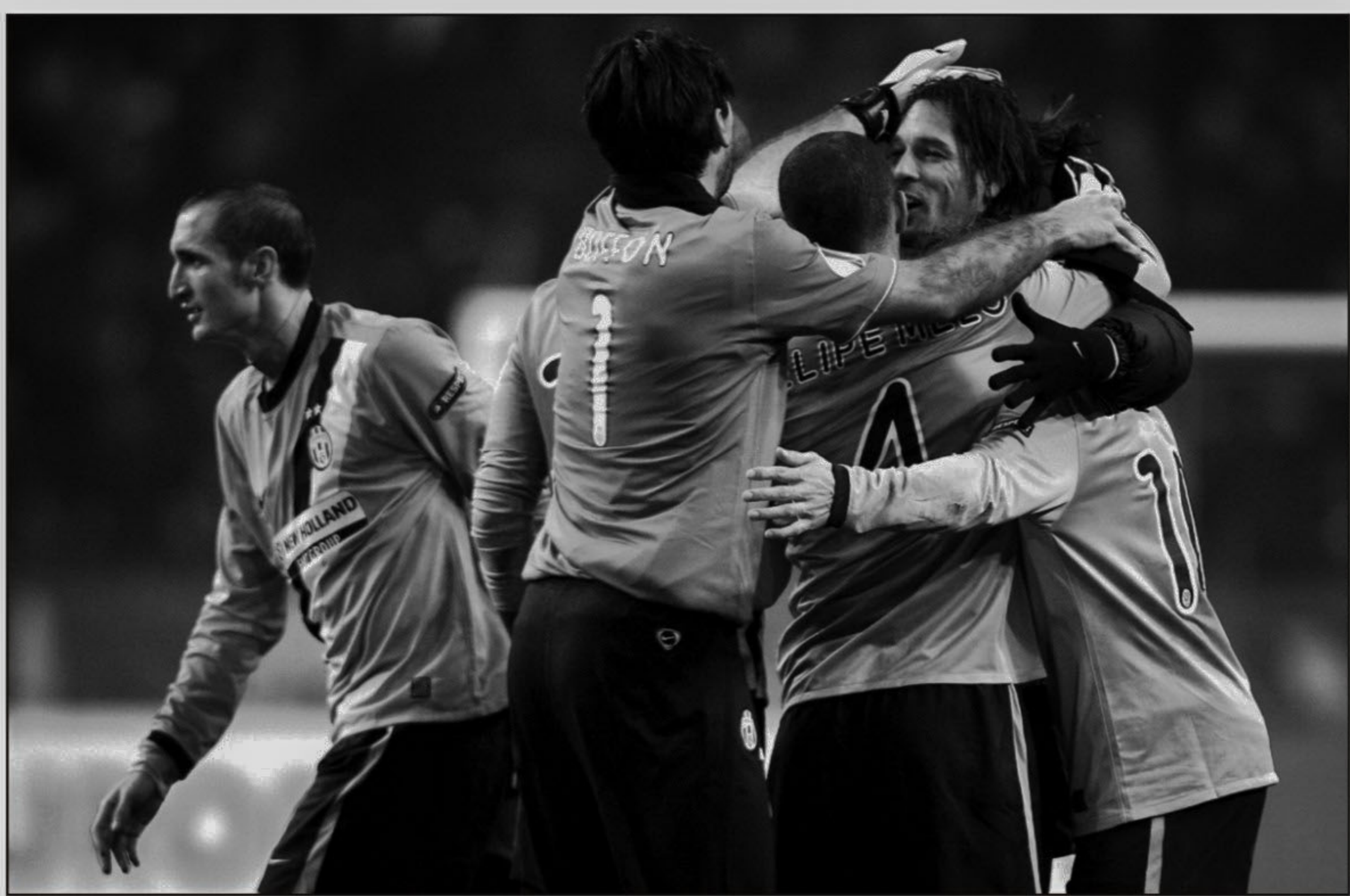
Juventus players congratulate teammate and goalscorer Amauri (R) at the end of their Europa League encounter against Ajax in Amsterdam on Thursday.