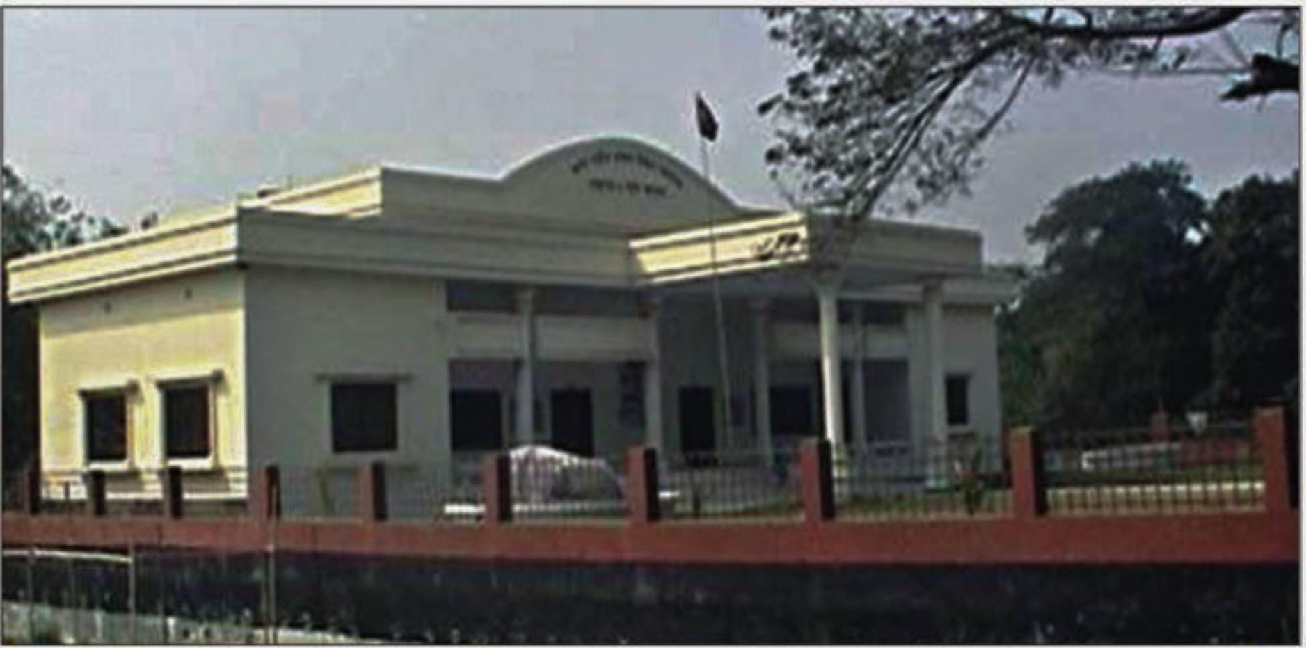
The library and museum.