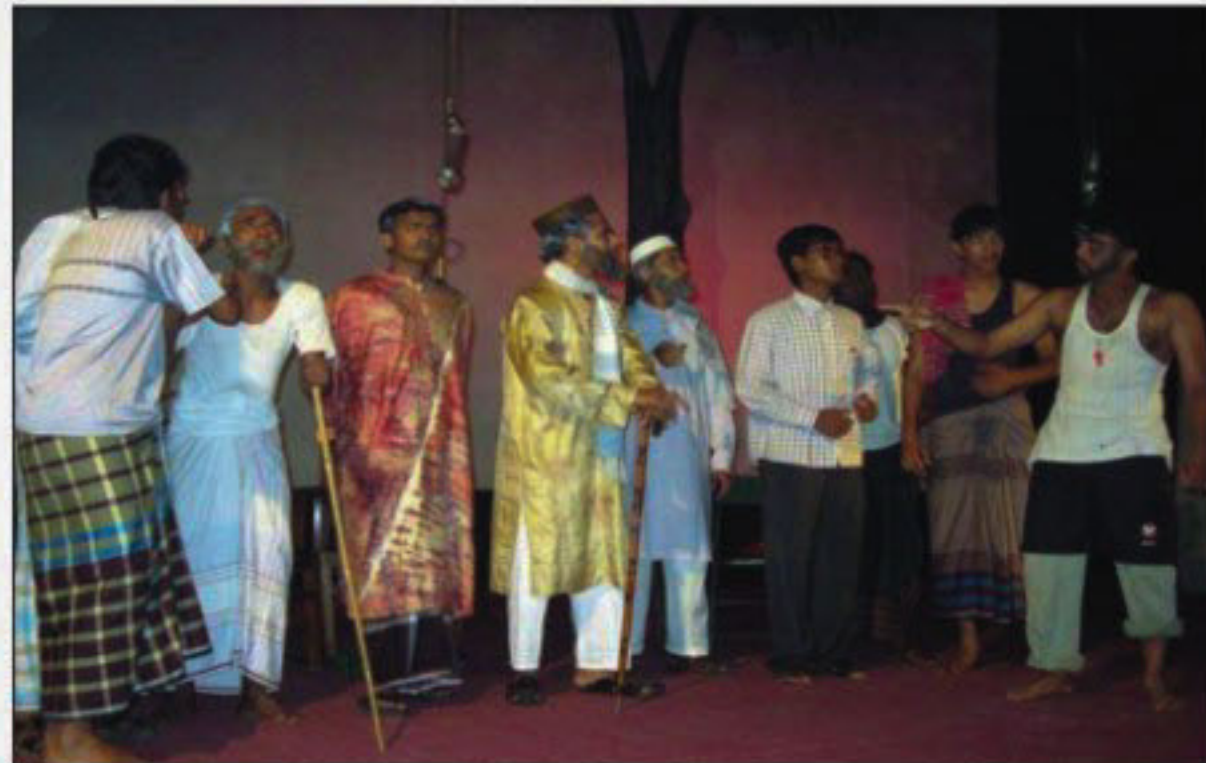
The festival was organised by Bangladesh Group Theatre Federation.