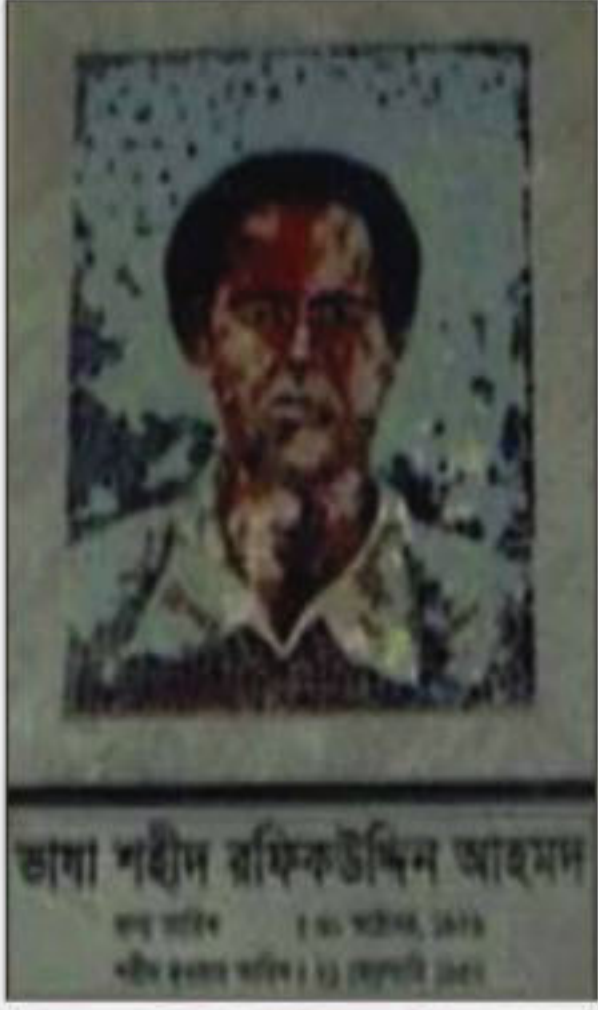
A mural of Shaheed Rafiq at the establishment.

able endeavour, locals complain that the museum has no memorabilia related to Shaheed Rafiq. There is only a portrait of him. Visitors, from various parts of the country,