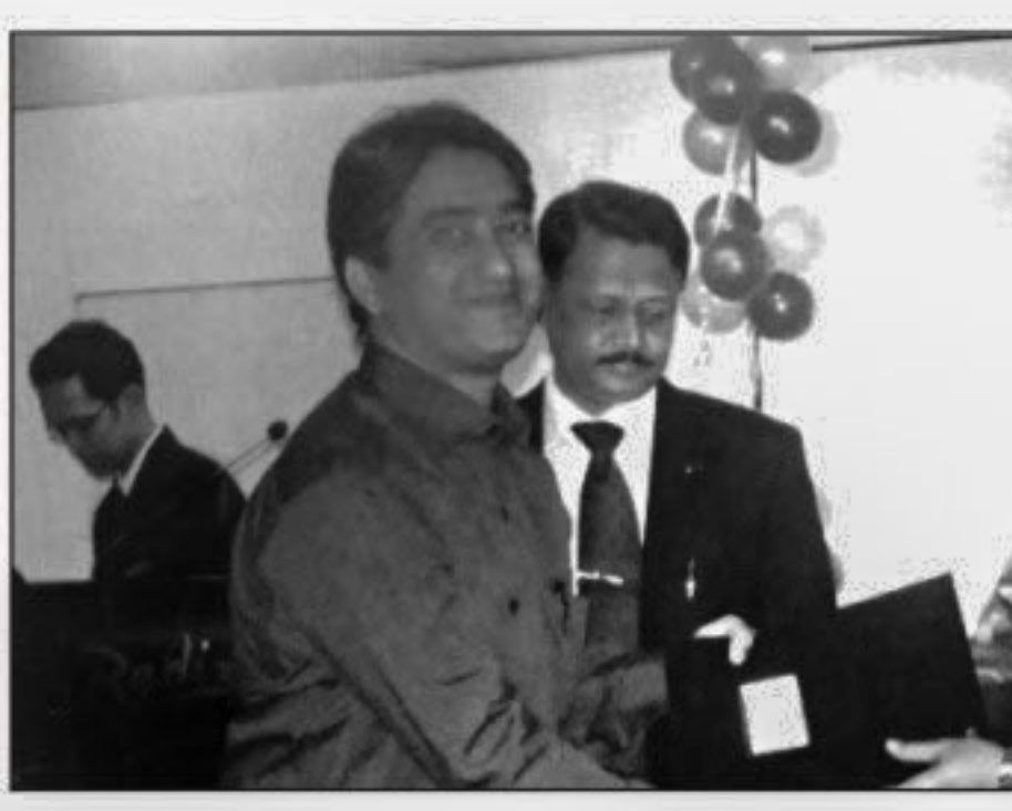
Major General ATM Shahidul Islam, adjutant general of Bangladesh Army and vice chairman of Sena Hotel Developments Ltd, hands over a certificate to one of the 20 successful candidates of a food and beverage course conducted by the Sena Hotel Management Institute, at Radisson Water Garden Hotel in Dhaka on Wednesday.

Local Market FX The local market traded actively today. USD/BDT rates were stable today. Money Market Money market rates traded in the range of 3.5-4.5. Most deals traded around 4.0%. The market was liquid.