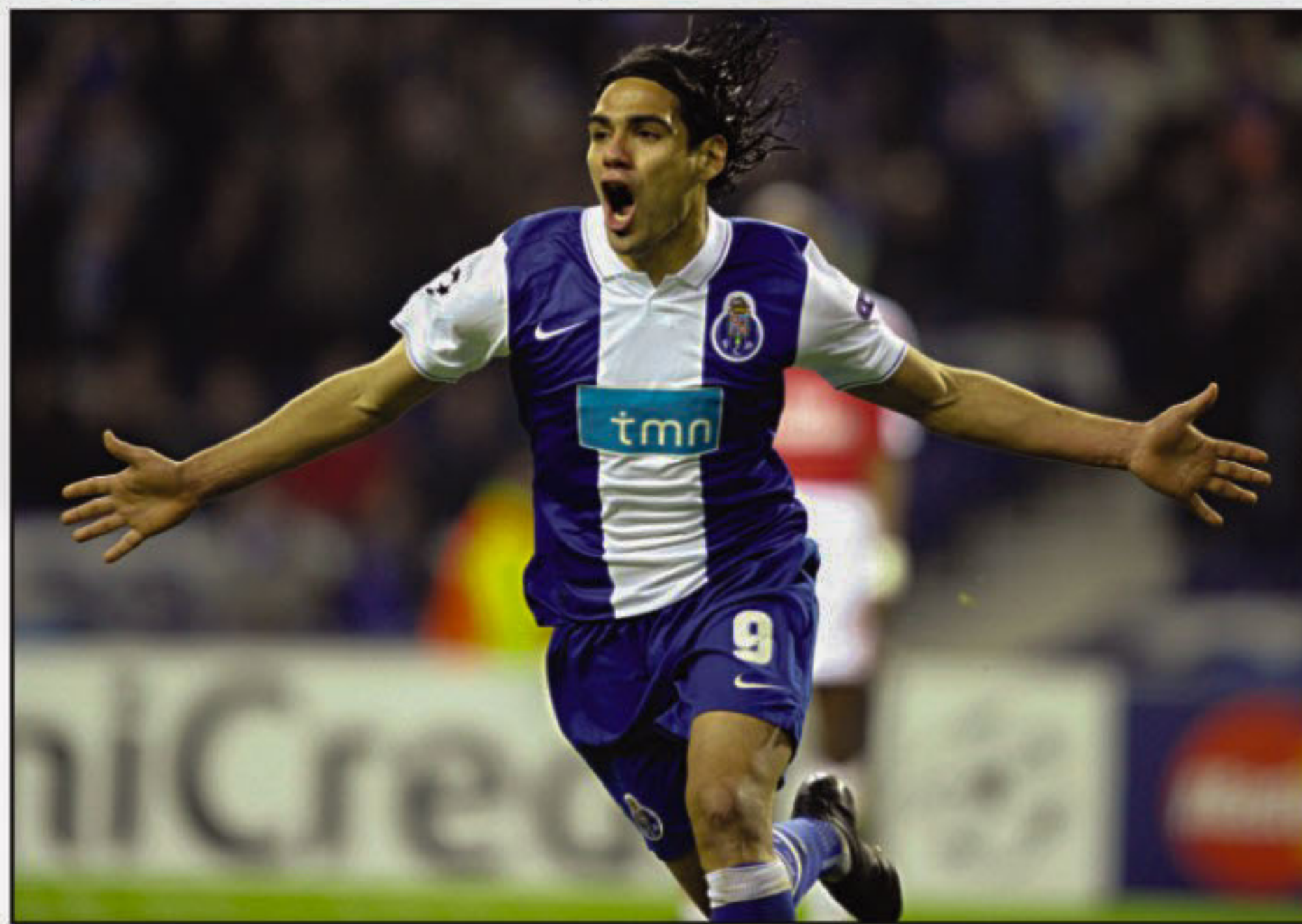
Porto forward Radamel Falcao is elated after scoring the winning goal against Arsenal during their Champions League round of 16 tie at the Dragao Stadium on Wednesday.