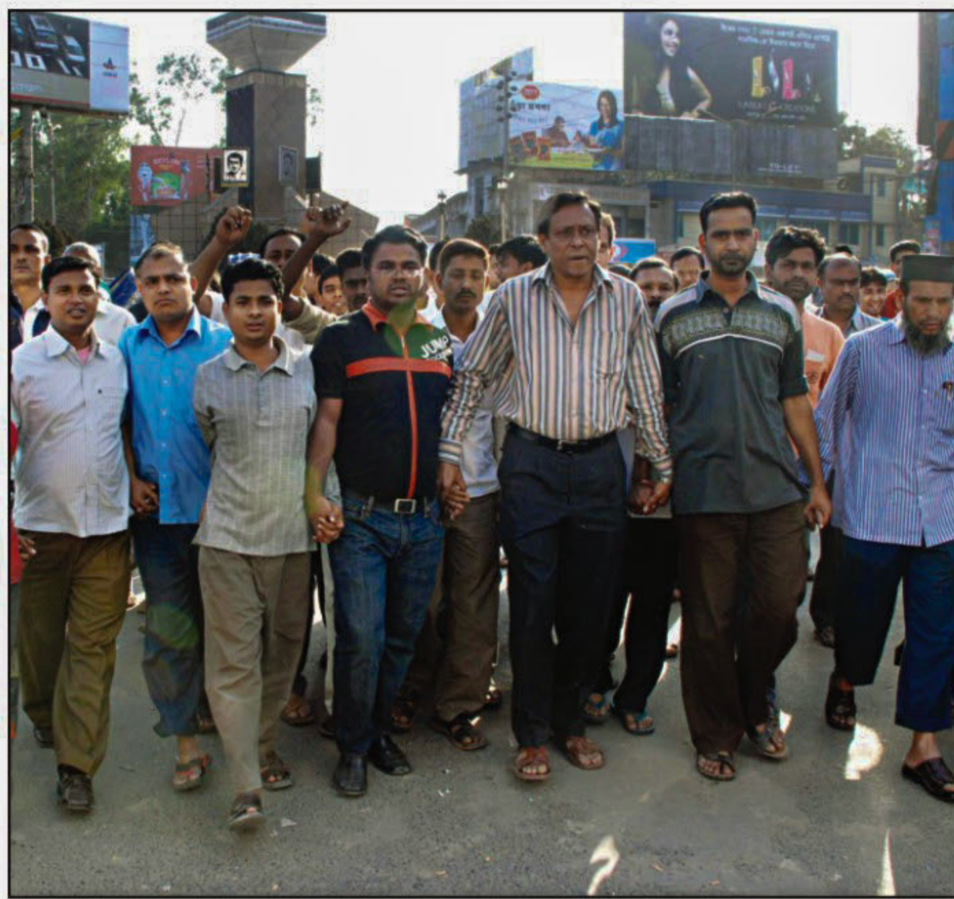
Local businessmen bring out a procession in Bogra town yesterday protesting Jubo League and Chhatra League men's alleged attempt to illegally occupy government land at Rafique Khan Market in the town.

After receiving the body, BDR gave it to police who later handed it over to the victim's family members.