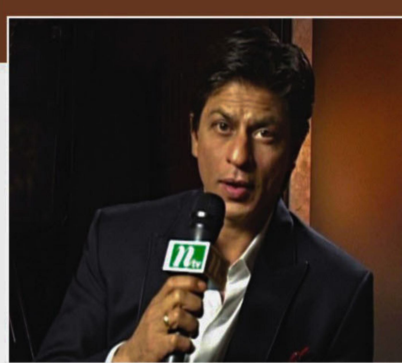
Shahrukh Khan speaks to ntv.

The programme also included an interview of Karan Johar (director of "My Name is Khan"), a promo of the movie and excerpts from a press conference on the movie in London attended by Shahrukh Khan, Kajol and others.