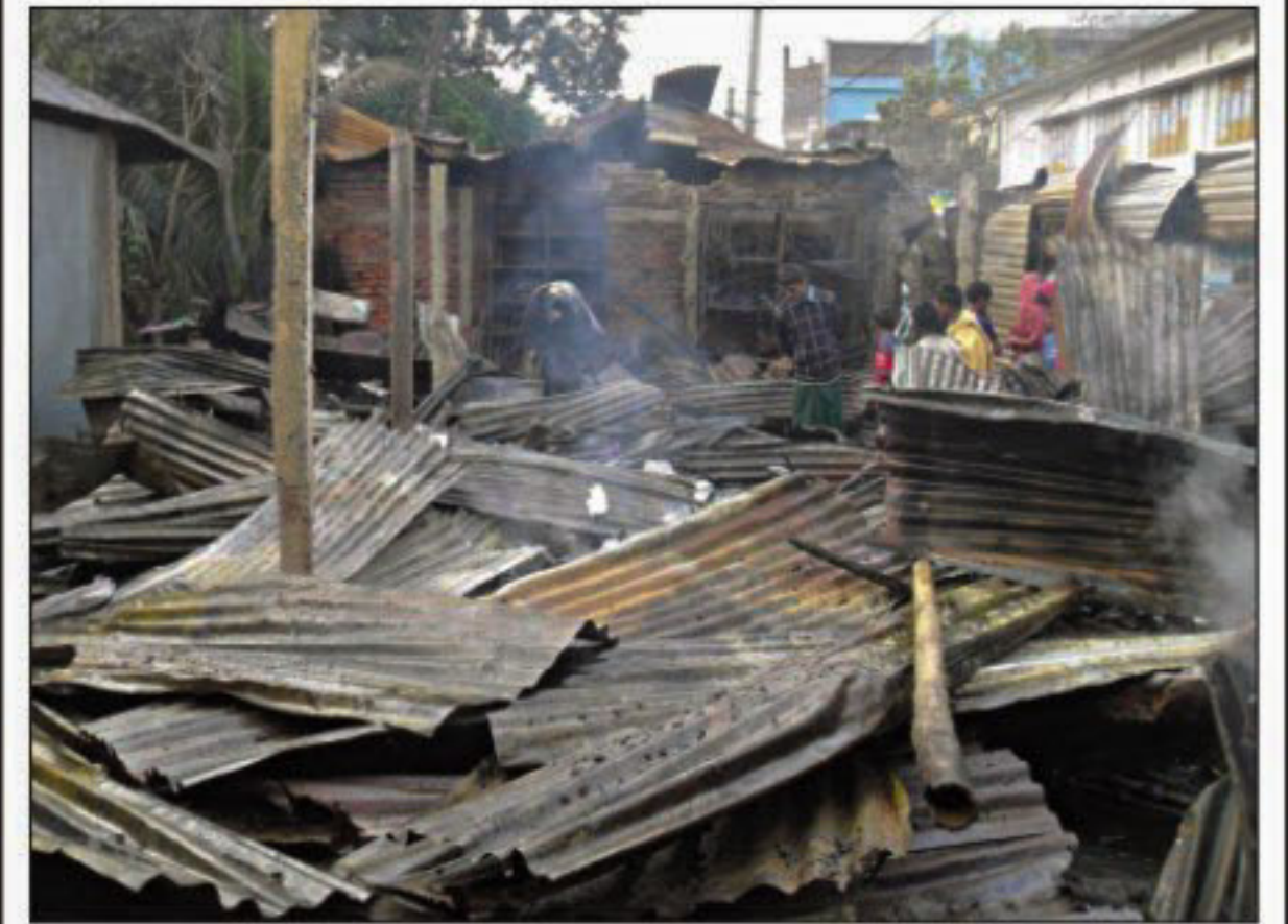
Corrugated iron sheets, used as shop roofs, lie twisted as a devastating fire gutted 13 shops at Senbagh Bazar in Noakhali district early yesterday. The fire, originated from an electric short circuit, damaged property worth Tk 40 lakh before firefighters and locals doused the blaze.

The Sundarbans Wildlife Conservation Department in Khulna has rescued a stray hanuman (monkey) from Morelganj in Bagerhat on Monday evening. Sunderbans East Divisional forest official Mihir Kumar Dey said, the grown up hanuman was found in Sankinhanga area. The officials with the help of some local journalists brought the injured hanuman to Morelganj Veterinary Hospital for treatment. The hanuman will be released in Keshobpur natural habitat of monkeys, the officials said.