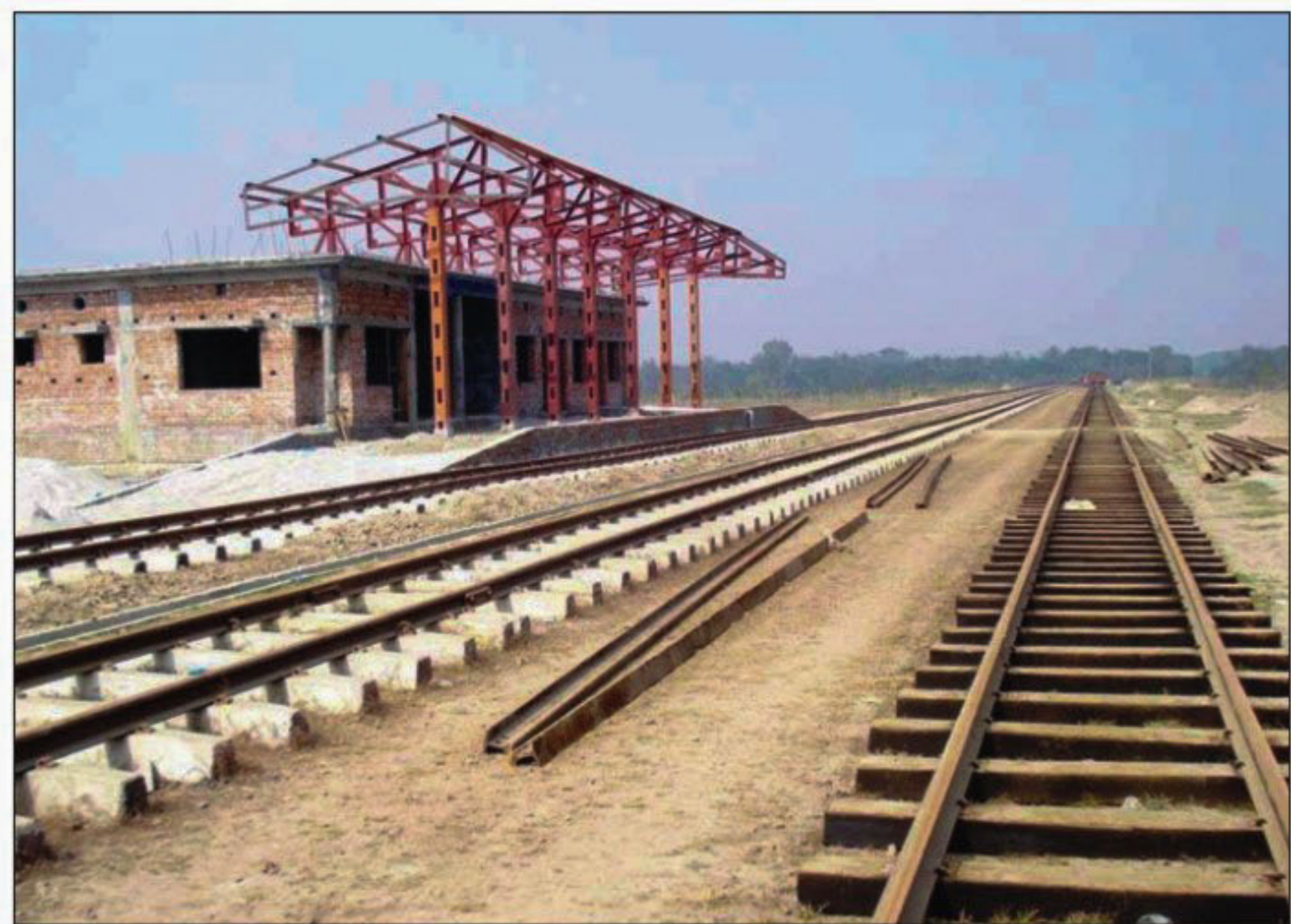
Construction of Bhuapur Rail Station in Tangail heading towards completion as 36-kilometre rail track on Bangabandhu Bridge-Tarakandi route is scheduled to be open for train communication in May.

Finally, a meeting of the ECNEC in 2008 decided to extend the project time for the next two years and raise the allocation to Tk 216 crore.