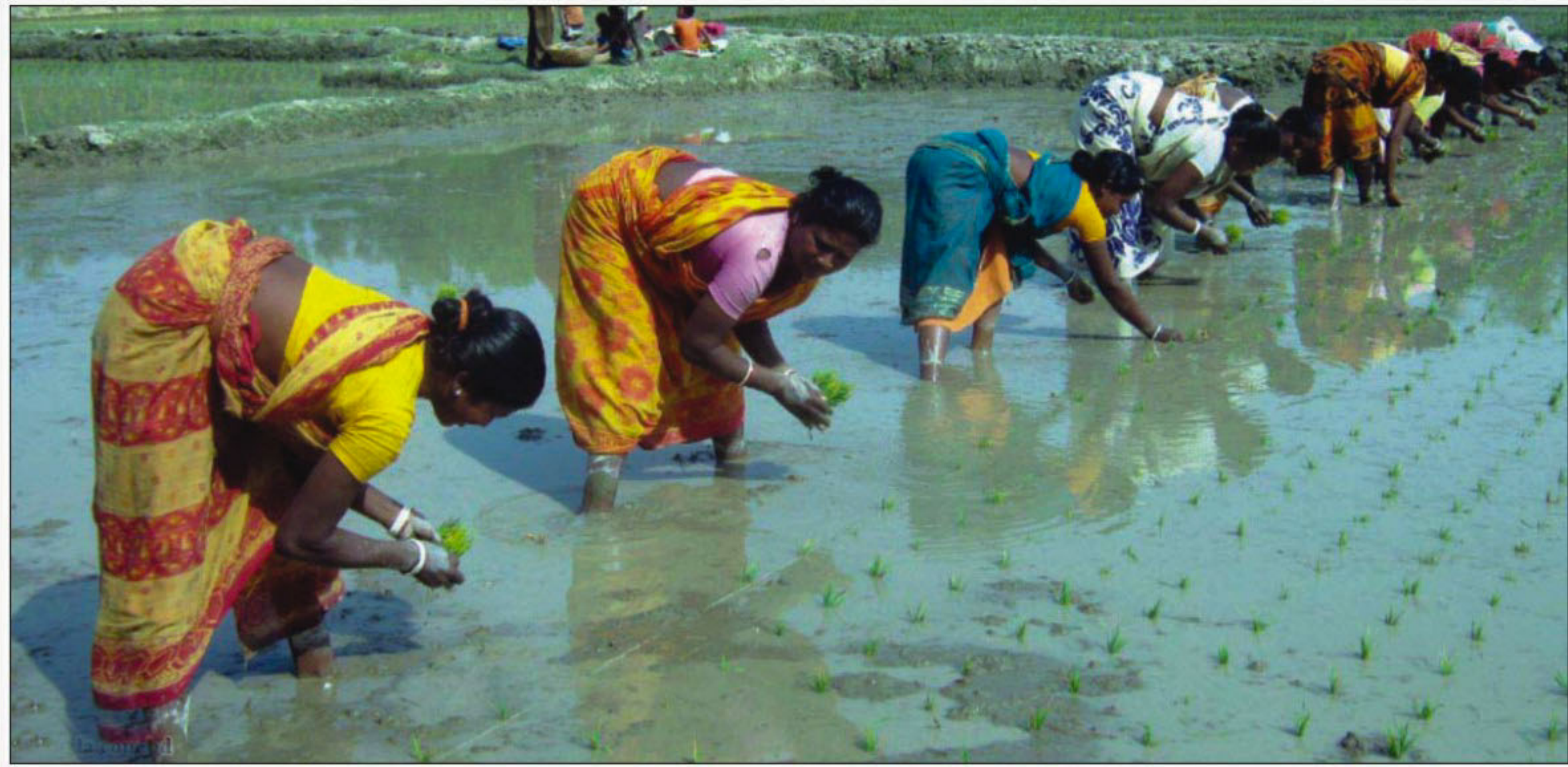
Indigenous women planting boro at a field of Lakkhitala in Shashara union under Dinajpur Sadar upazila Saturday.