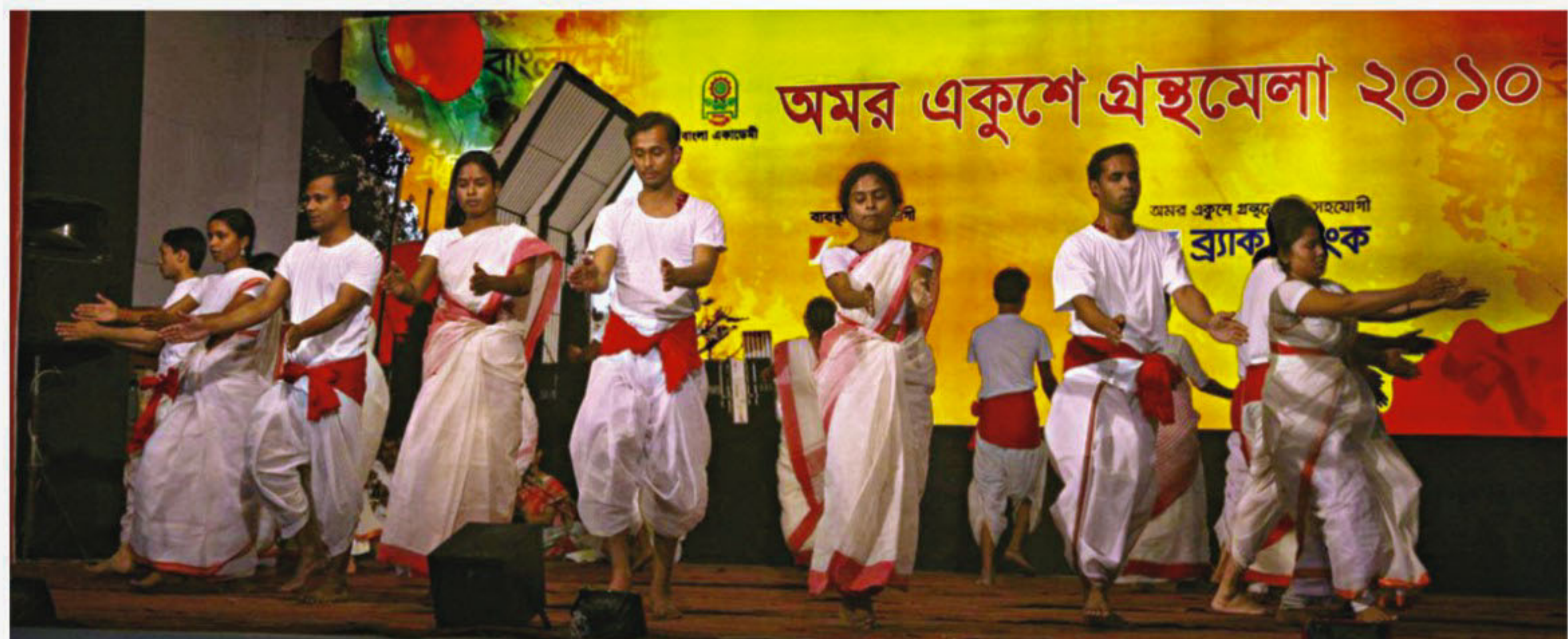
Artistes of Bratachari Samiti Bangladesh during a performance.