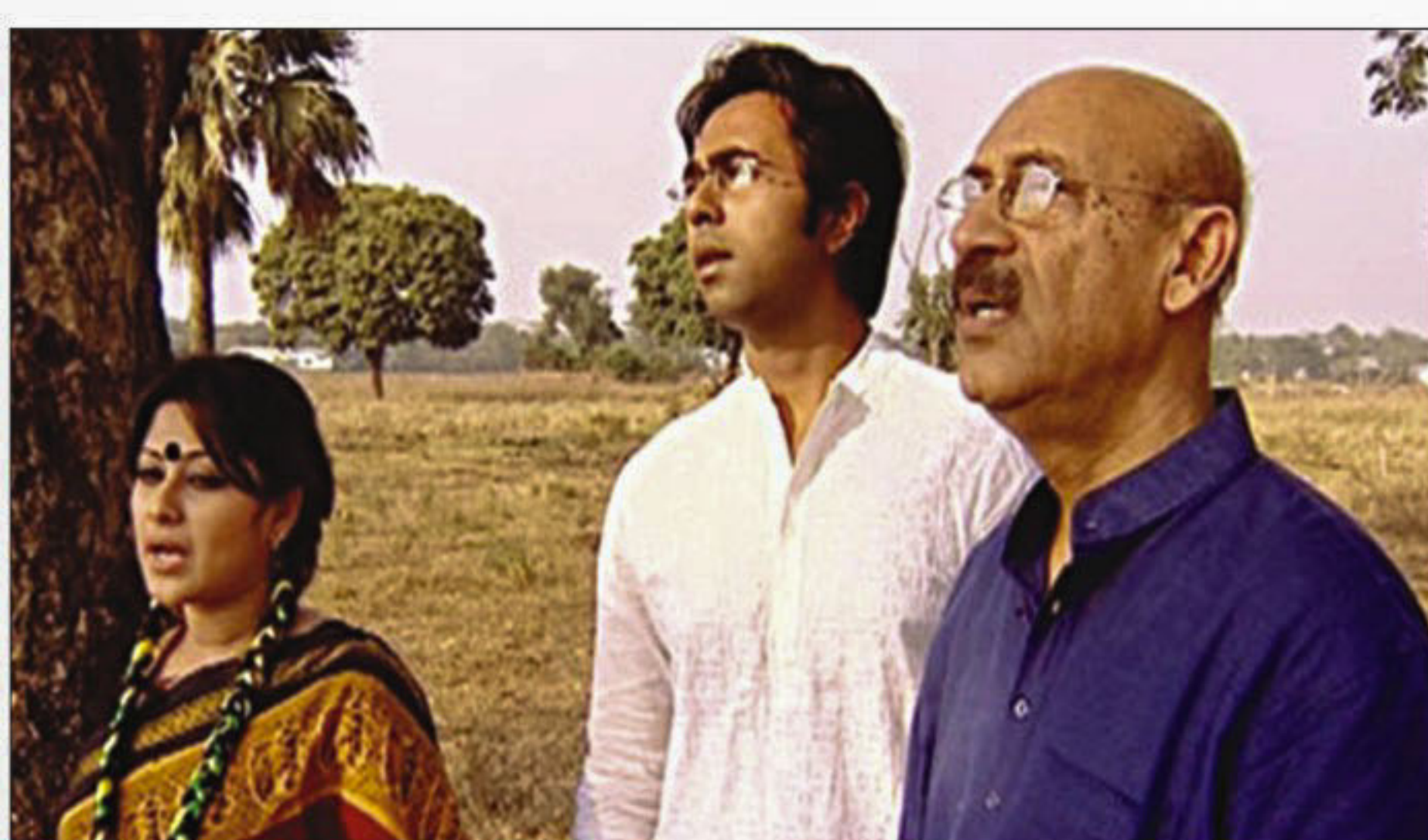
(From left) Sumaiya Shimu, Apurbo and Abul Hayat in "Paap".