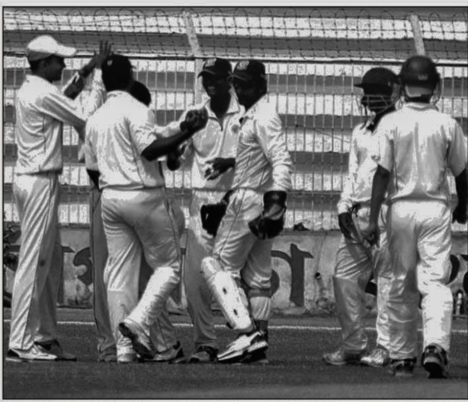
The players of Rajshahi celebrate the fall of another Chittagong wicket during the opening day of their four-day National League match at the Shaheed Chandu Stadium in Bogra yesterday. Chittagong were bowled out for 198 runs.