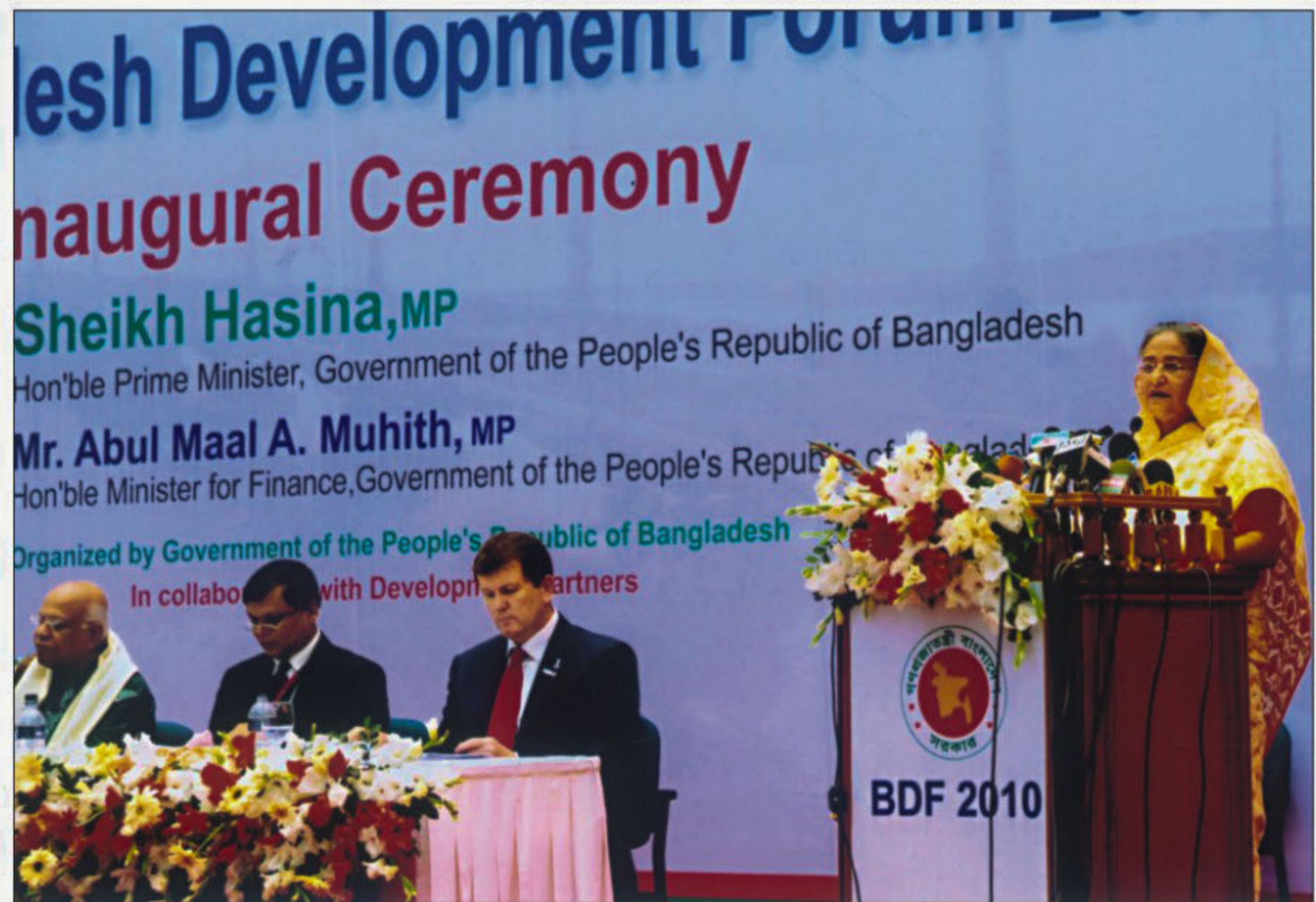
Prime Minister Sheikh Hasina speaks after inaugurating the first session of two-day Bangladesh Development Forum 2010 in the capital's Bangabandhu International Conference Centre yesterday.