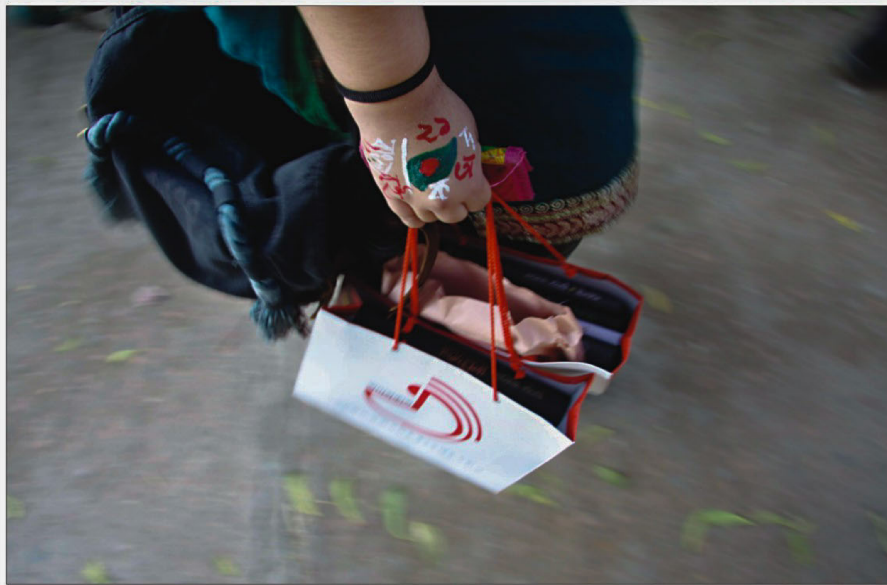
A girl returns from Amar Ekushey Book Fair yesterday. The painting on the back of her hand enthusiastically suggests the date -- February 21 -- language movement day.