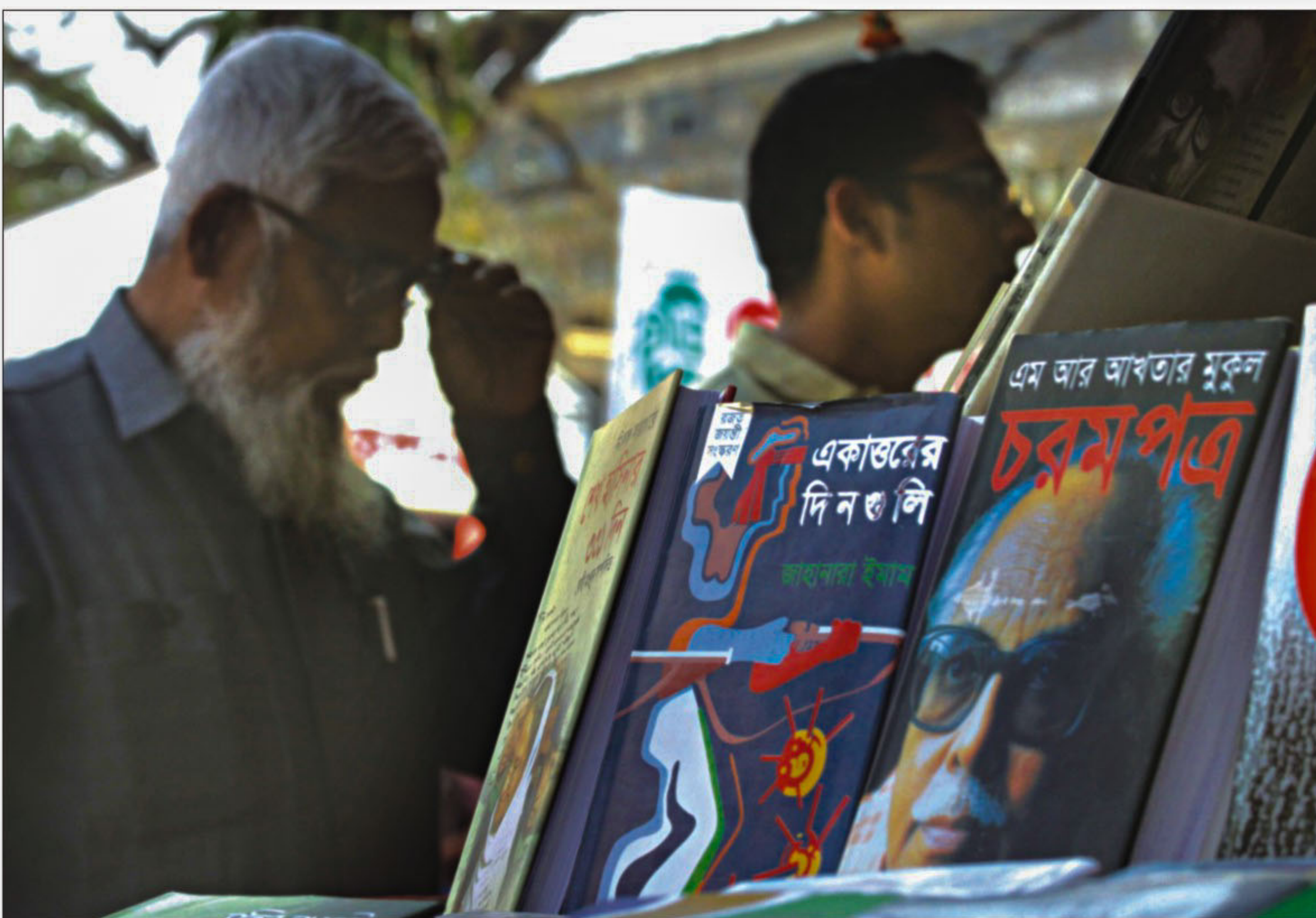
An elderly person scans a bookstall to find out books of his choice at Amar Ekushey Book Fair at Bangla Academy in the city yesterday. The month-long book fair began on February 1.