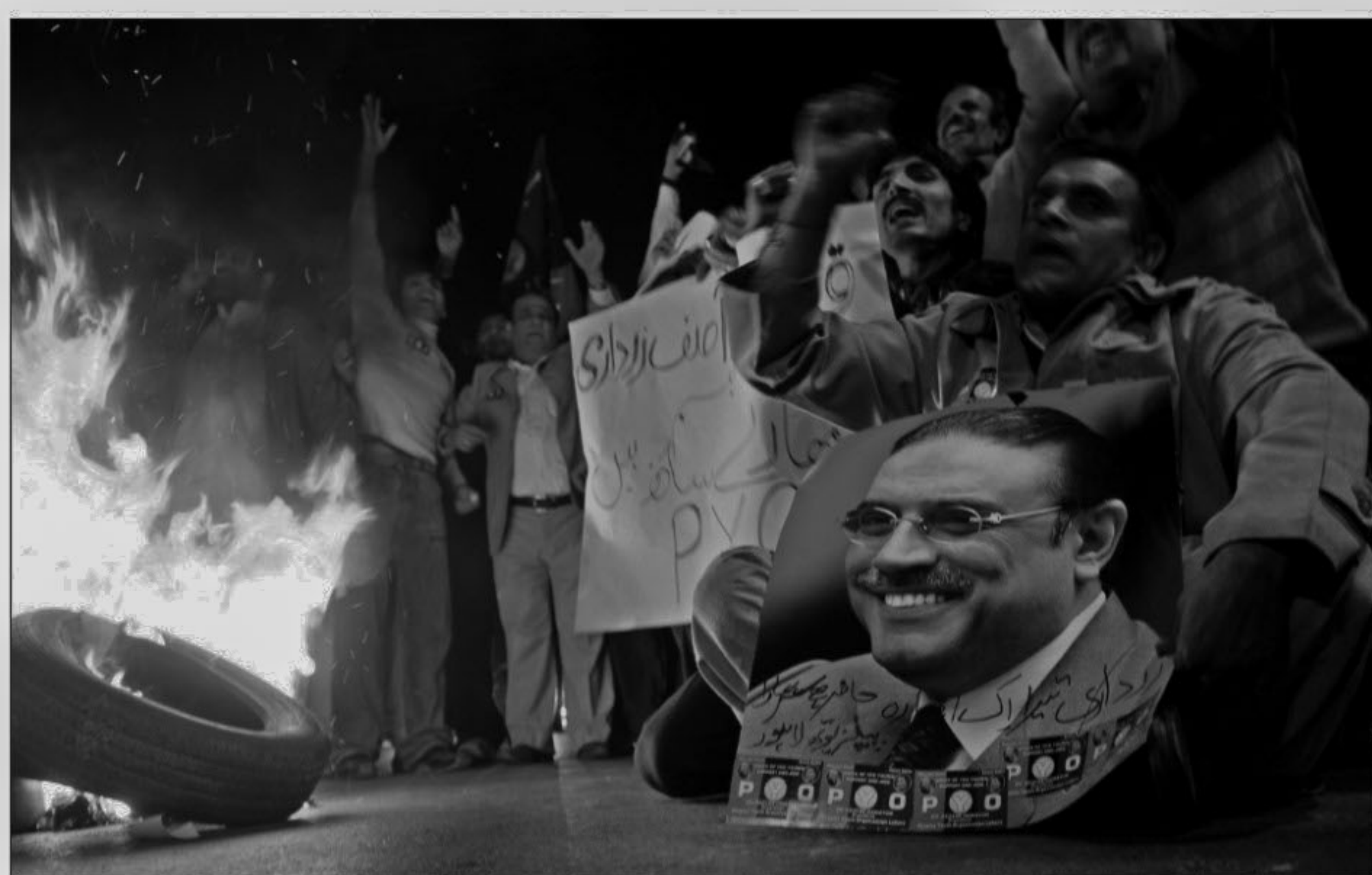
Supporters of Pakistan's President Asif Ali Zardari shout slogans during a pro-Zardari rally in Lahore early yesterday. Pakistan faced fresh turmoil on Sunday after Zardari and the top judge clashed over court appointments, threatening a showdown between the fragile government and judiciary.

Some TV channels quoted government critics as saying the appointment of the judges could be used as the basis for a fresh challenge against Zardari's hold on the presidency. Other media said Zardari may have to accept a humiliating back-down and agree to the court's recommendations on the appointments, while also criticizing the court for escalating political tension in the country.