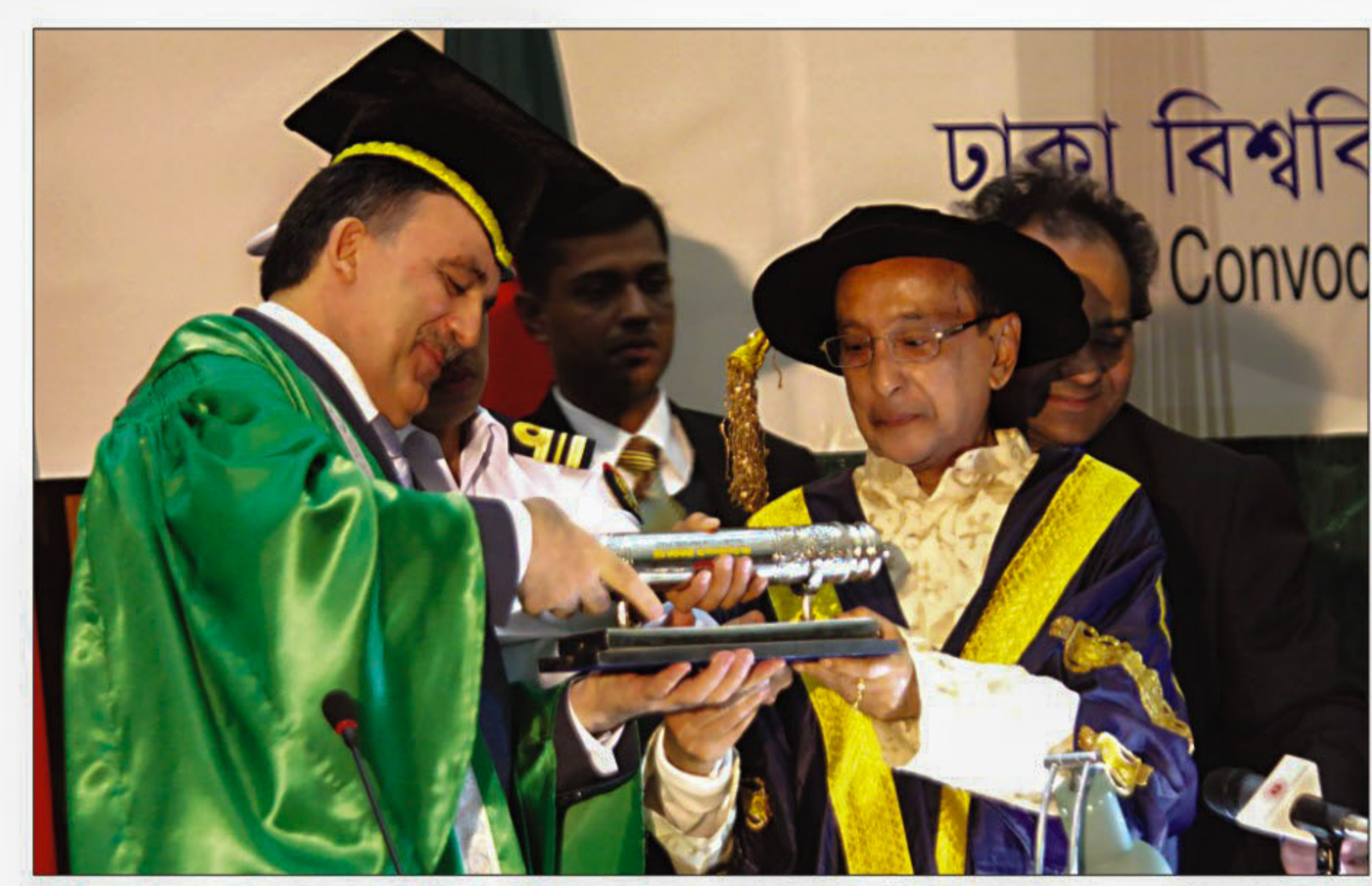
President Zillur Rahman, also the chancellor of Dhaka University, awards Abdullah Gül with an honorary Doctor of Laws degree at a special convocation at the Nawab Ali Chowdhury Senate Bhaban of the university yesterday.