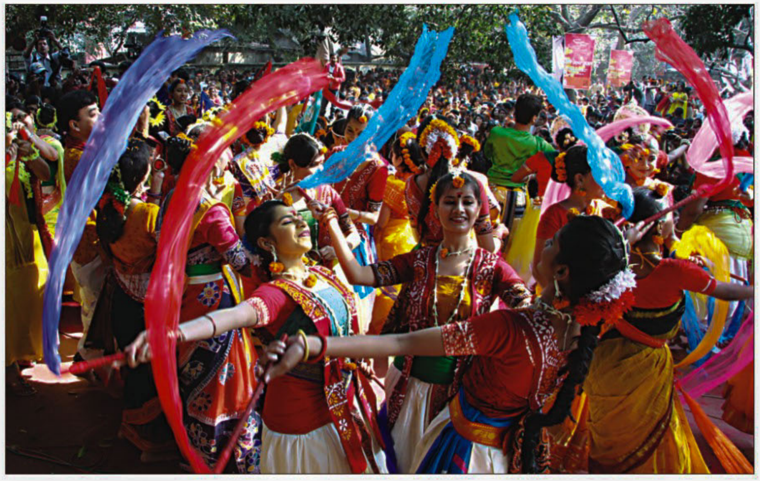
Here comes the spring, Basanta , king of all seasons. City people, especially women dressed in symbolic yellow sari, celebrate Pahela Falgun , first day of the joyous and colourful season, singing and dancing at the Institute of Fine Arts of Dhaka University yesterday.